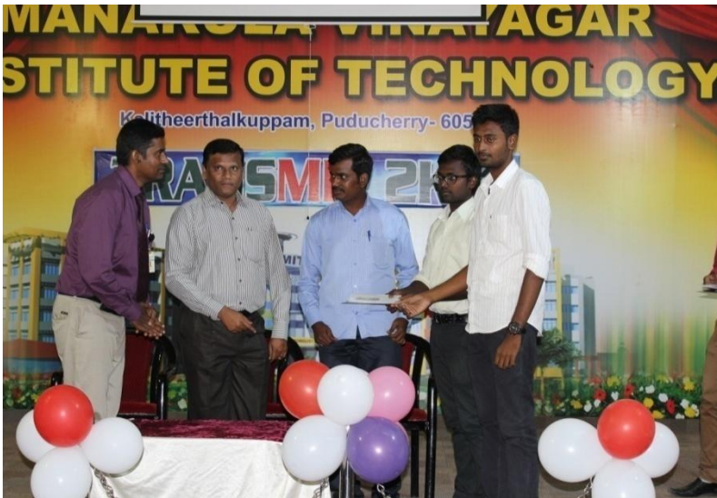
Non Technical Symposium “TRANSMIT-2014” organized under ELECTRA held on 30.08.2014.