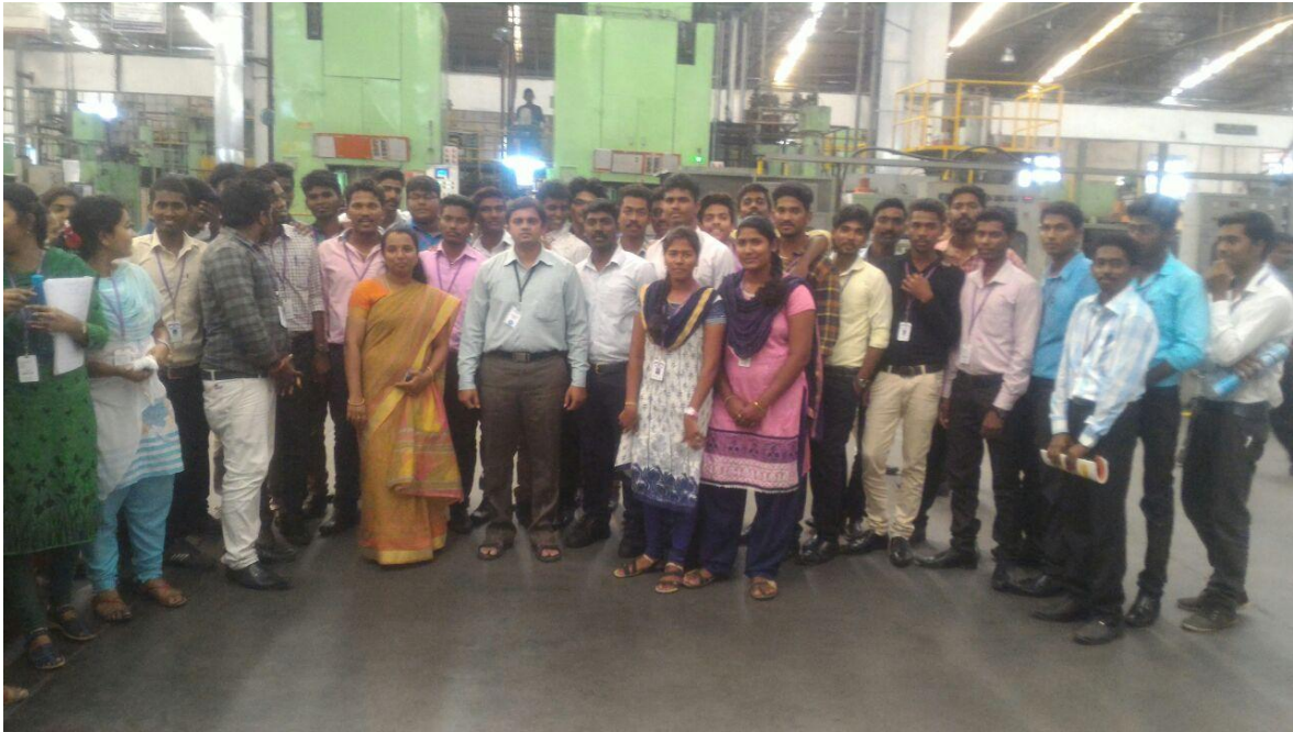
An Industrial Visit was arranged to M/s Rane Brake linings Ltd, Puducherry for first year MBA Students on 14 th February 2017.