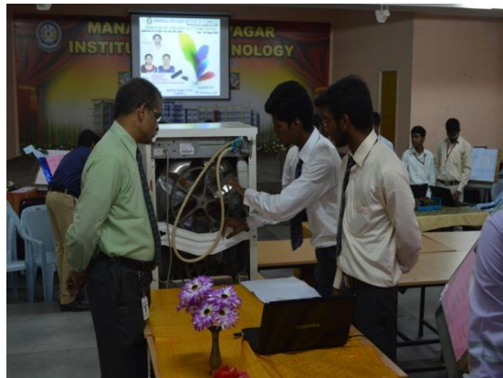
Consumer Electronics Expo (MODERN'14)