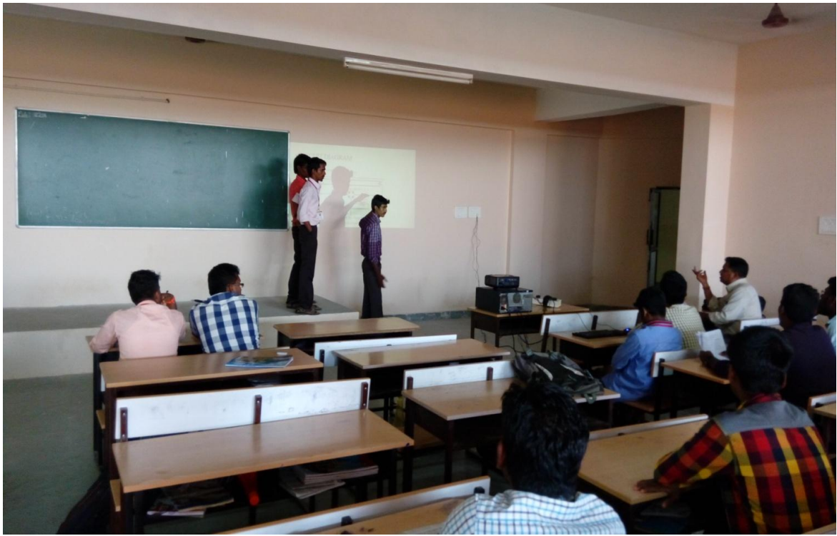
Fig.19 Mini project review was conducted for 3 rd year EEE students on 2 nd February 2016