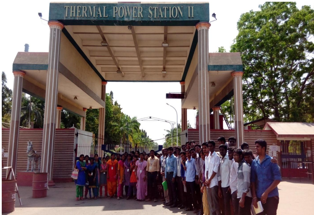
Fig.31 Industrial visit to Thermal power station, Neyveli on 18 th February 2016