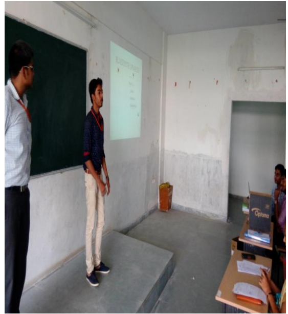
Fig.11 Mini Project Review was conducted for 2 nd year EEE students (A & B sec) on 13 th January 2016