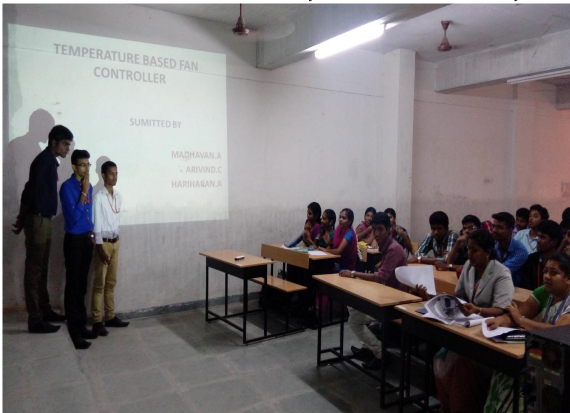
Fig.22 Mini project first review for 2 nd year EEE students on 8 th February 2016