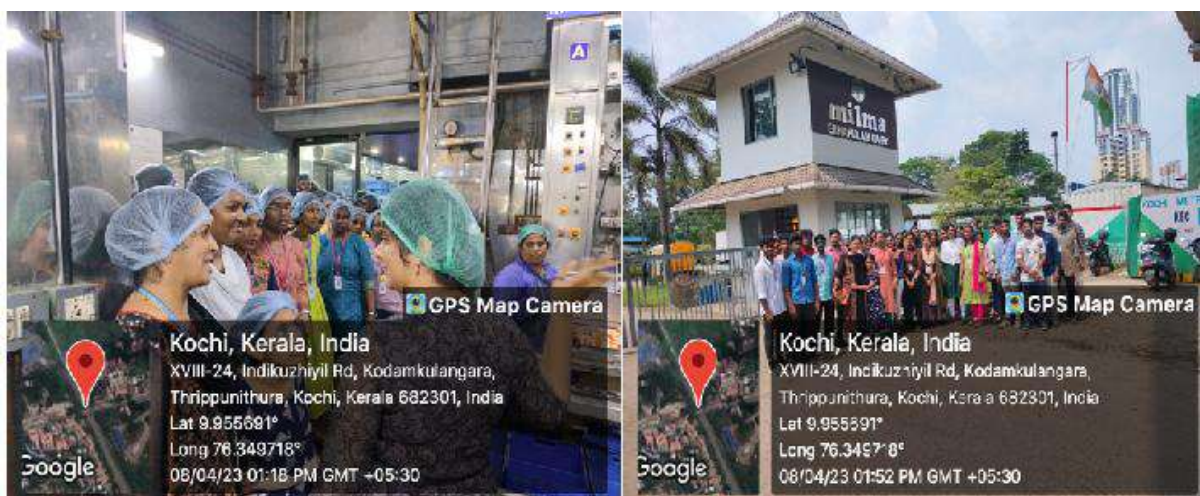
Industrial visit to Milma Dairy, Cochin for all Second & third year Food Tech. students on 08 th April, 2023.