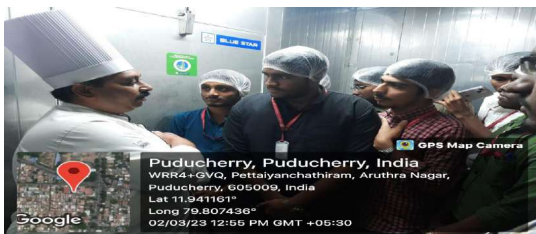
One day hands on training on HACCP technique was conducted at Hotel ACCORD Puducherry for the third year food technology students on 02 nd March, 2023.