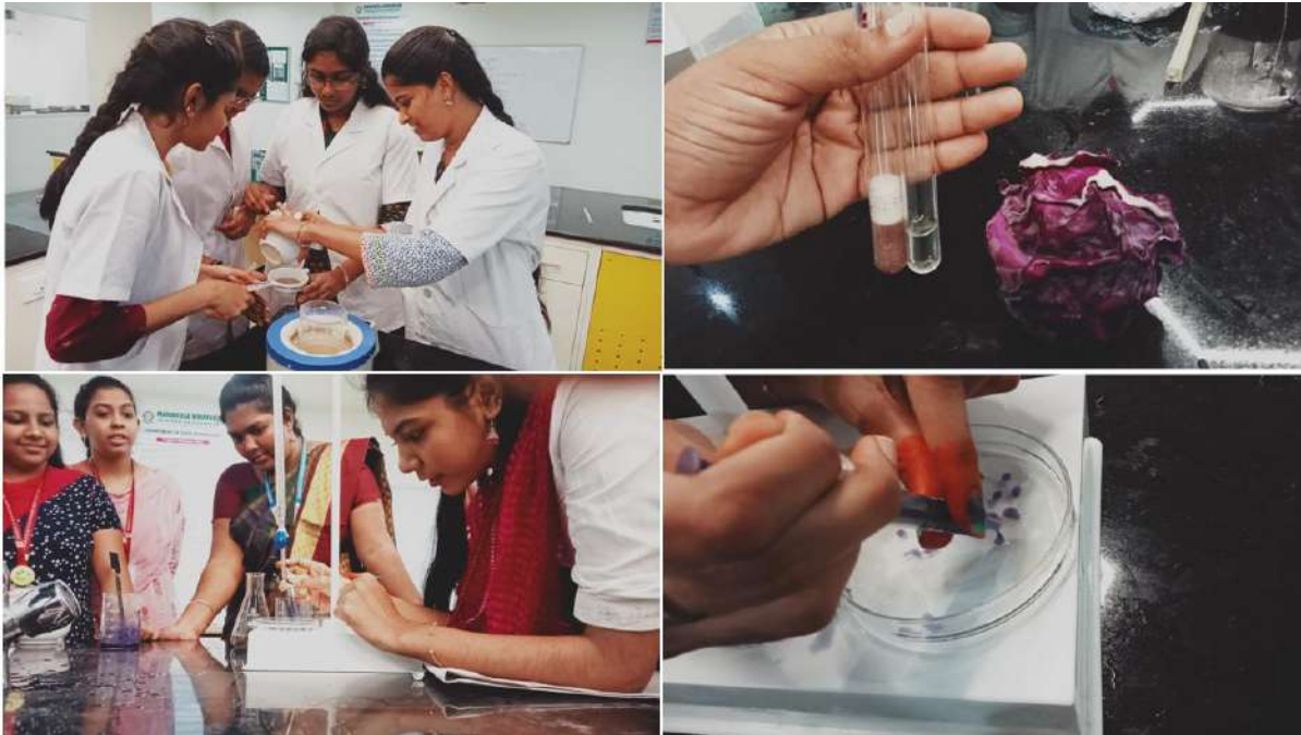
B.Tech.(FT)-3 rd year engaged in mini project products in the Food Analysis Laboratory during the semester.