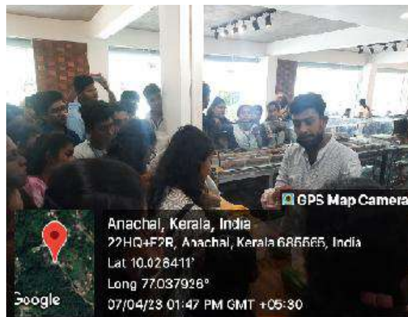
Industrial Visit to MACOFA Chocolate Factory, Munnar for all second & third year Food Tech. students on 07 th April, 2023.