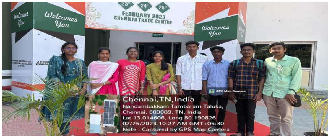
Third year food technology dreams students attended the Product Expo held at Trade centre, Chennai on 25 th February, 2023.