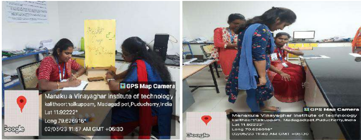
Health Awareness Camp has been organised to commemorate World Health Day-2023 on 02 nd May, 2023