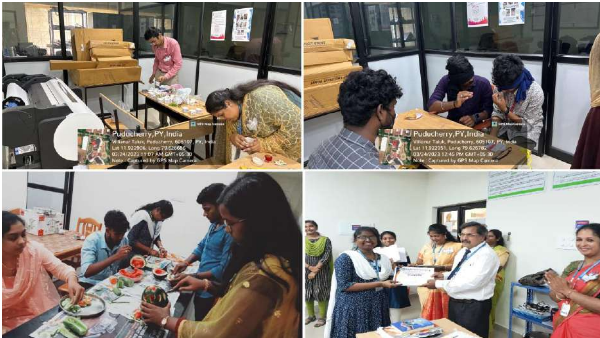
Various events conducted by the Department of Food Technology during MITILENCE-2023 on 24 th March, 2023