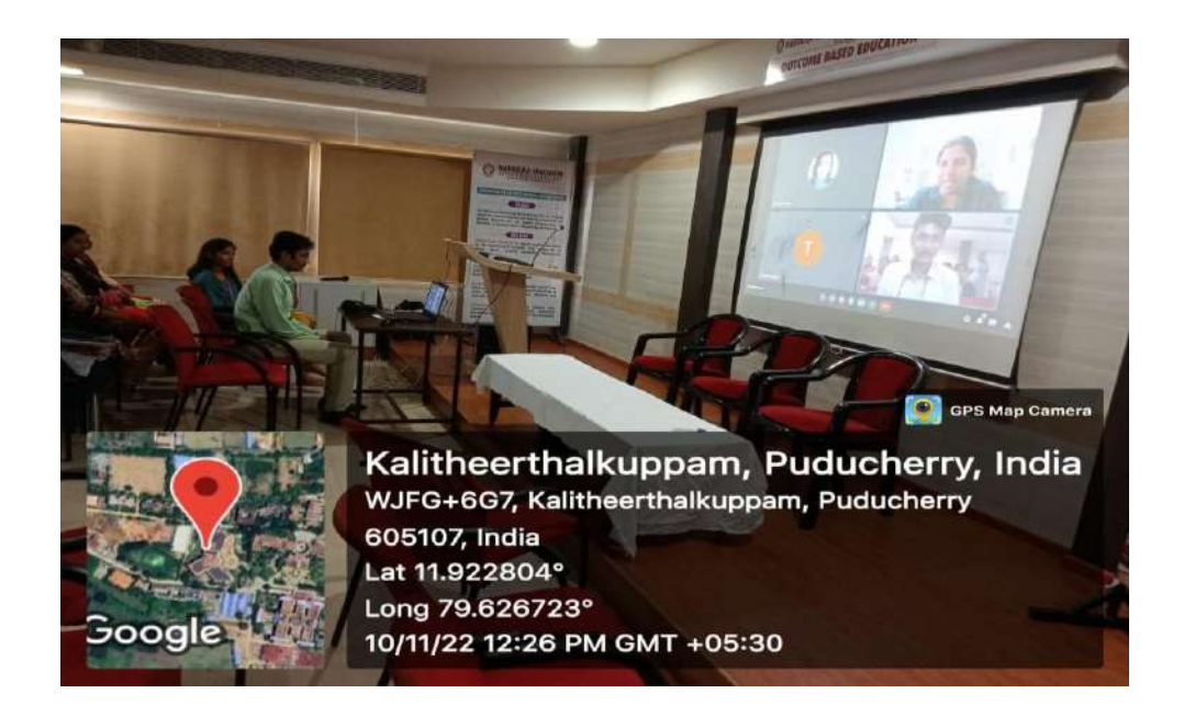
Guest lecture by industry experts - Seminar on "Organic Food Industry"