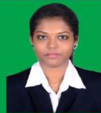
PRESIELA.J ATOS SYNTEL 4.4 Lakhs