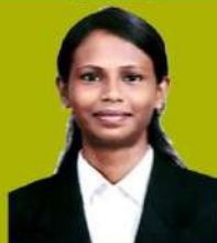
ALEXIA.A HCL 3.5 Lakhs