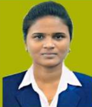
ABARNA.M HCL 3.5 Lakhs