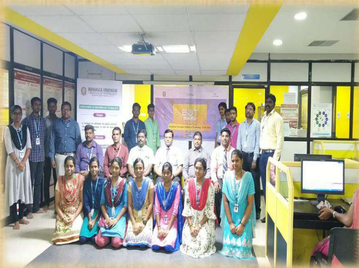
Our Dept Organized Two Days Online Certification Course on “ Automation Anywhere ”, in association with ICT Academy, Puducherry for IV Year on 10 & 11.2.2020 and for II & III year on 27 & 28.1.2020.