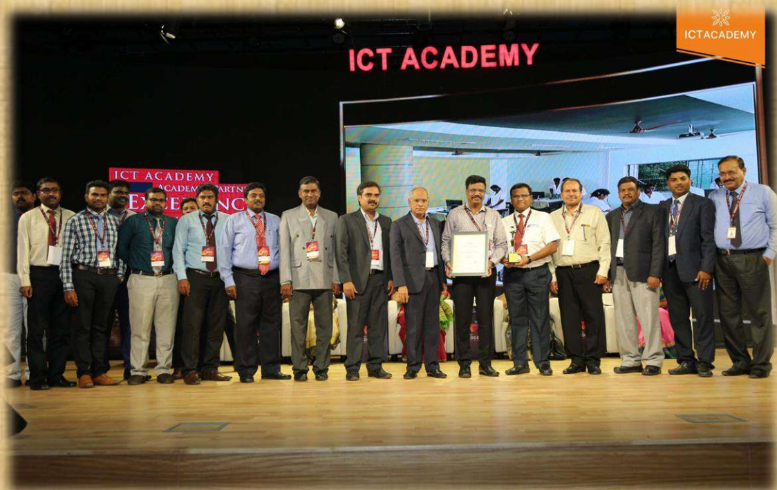
Won Academic Partner Excellence Award 2020 in BRIDGE 2020 held at Chennai on 28th February 2020 conducted by ICT Academy, Chennai.