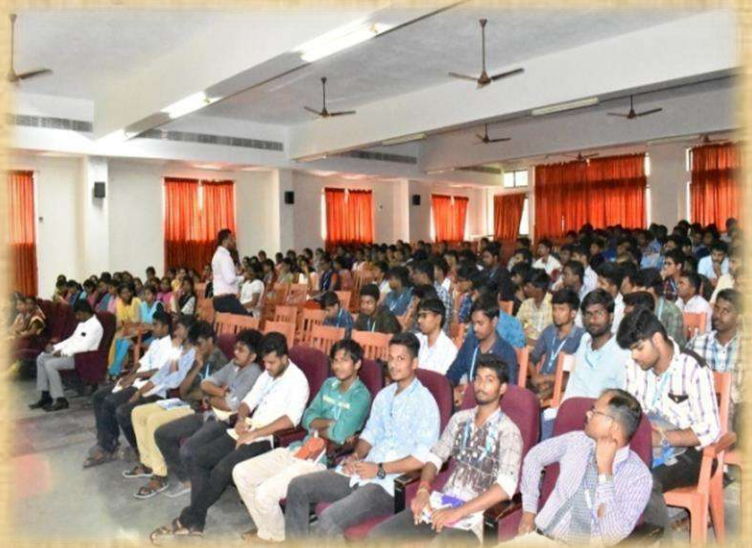
Guest Lecture on "Gate Forum Awareness Program on Importance of Gate & PSU Jobs" for IV Year IT Students on 26.08.19.