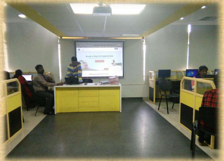
Our Department IV year IT – 15 Students have participated in 7 days Workshop on “ ADX 201 – Salesforce ”, organized by ICT Academy, Puducherry at MIT, Puducherry on 3rd to 10th September 2019.