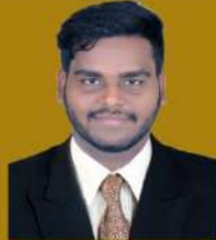
SARANIDARAN.K JUST DIAL 3 Lakhs