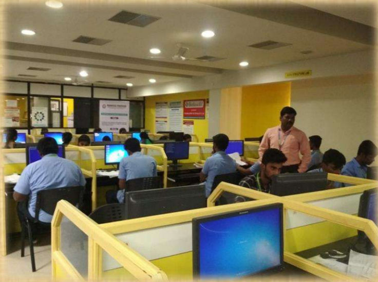
Internal workshop is conducted for III year IT students on "PL-SQL" during 04.07.2019 and 05.07.2019