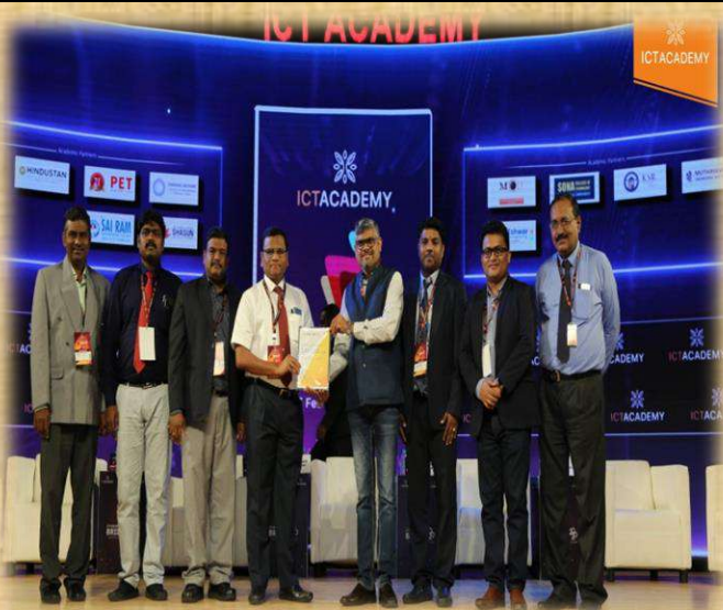
Received Center of Excellence Award from BOTLAB - Automation Anywhere , in Bridge 2020 conducted by ICT Academy, Chennai.