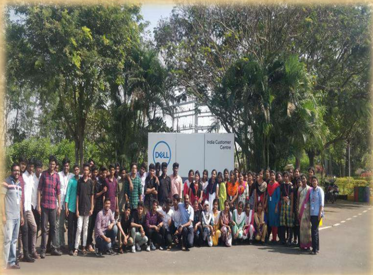
Our Department organized a one day Industrial visit to Dell International Services India Private Limited, Chennai for II year – IT Students on 24th January 2020.