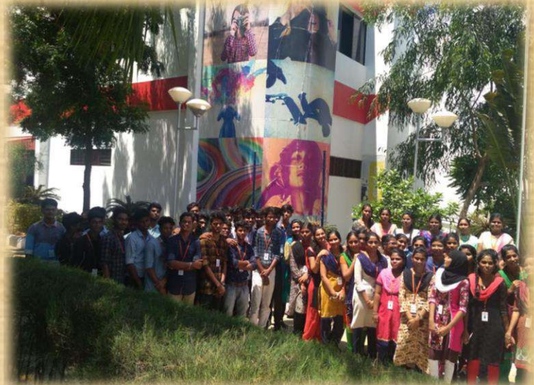
Our Department II year IT Students have under gone the Industrial Visit to Lenova, Pvt, Ltd., Puducherry on 12th July 2019.