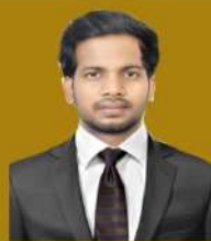
SERANJIVI JUST DIAL 3 Lakhs