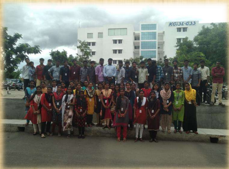
Our Department organized a two day Industrial visit to KGiSL institute of technology and Webnox Technologies Coimbatore for III year IT students on 19 and 20 July, 2019