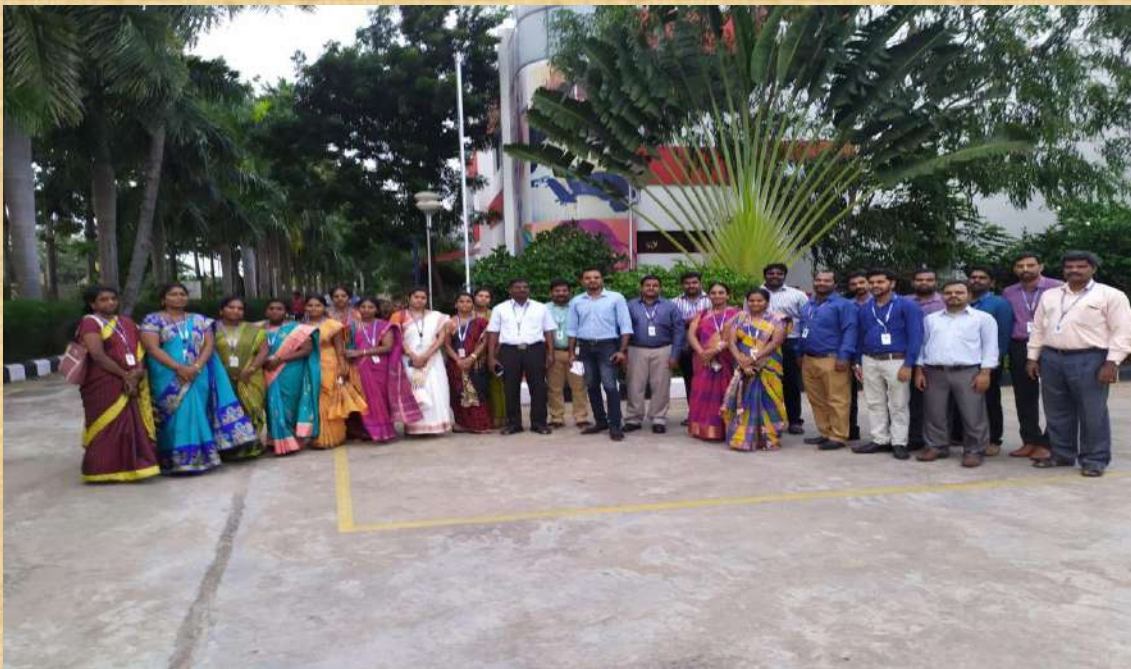
Our Department All Staff members have undergone Industrial visit to Lenova Pvt.Ltd., Puducherry on 6th December 2019.