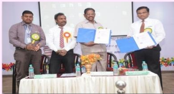
TCILIT AGENCY OF INDIA EDUCATION