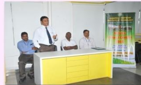
Arduino Project Contest