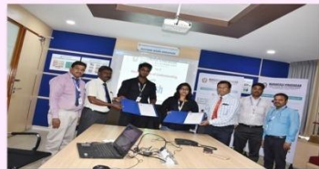
Shia#sh Focus on Better Education