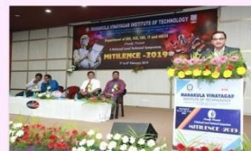
Symposium - Mitilence 2019