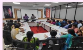
Workshop at Lenovo