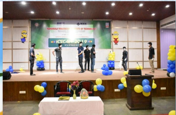
Culturals – Mime