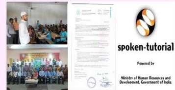
MoU With Spoken Tutorial - IIT Bombay