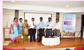
Cloud Computing Project Contest