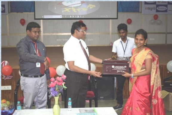
Distributing files to final year students