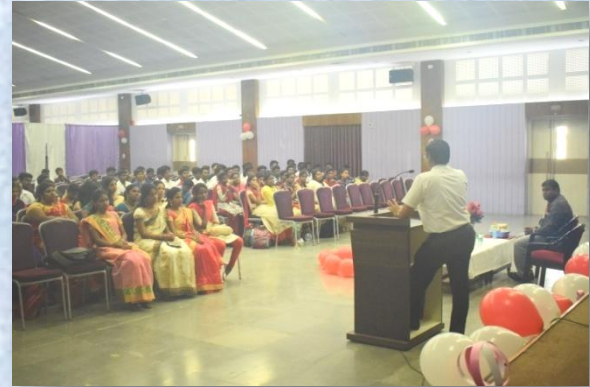
Principal addressing the students