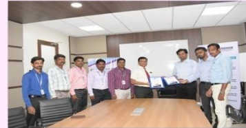
Cheri Technologies Part Of Education