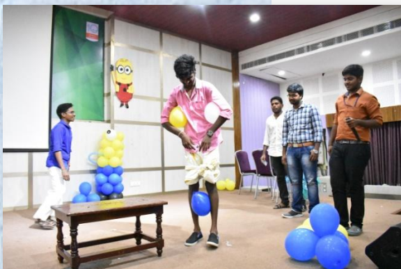
Activities to seniors