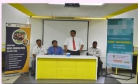
FDP on Hadoop (Hortonworks)