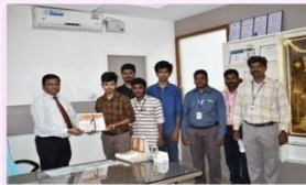
Innovators 2K19 First Prize