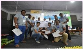
Hackathon 2018 Prize winners