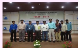
International Conference - ICAET