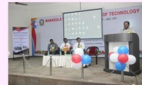
State Level PC Assembling Contest