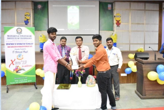
Choosing secretary for SAIT