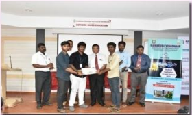
Android Project Contest 2019 Prize winners