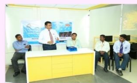
FDP on Mobile Application Development