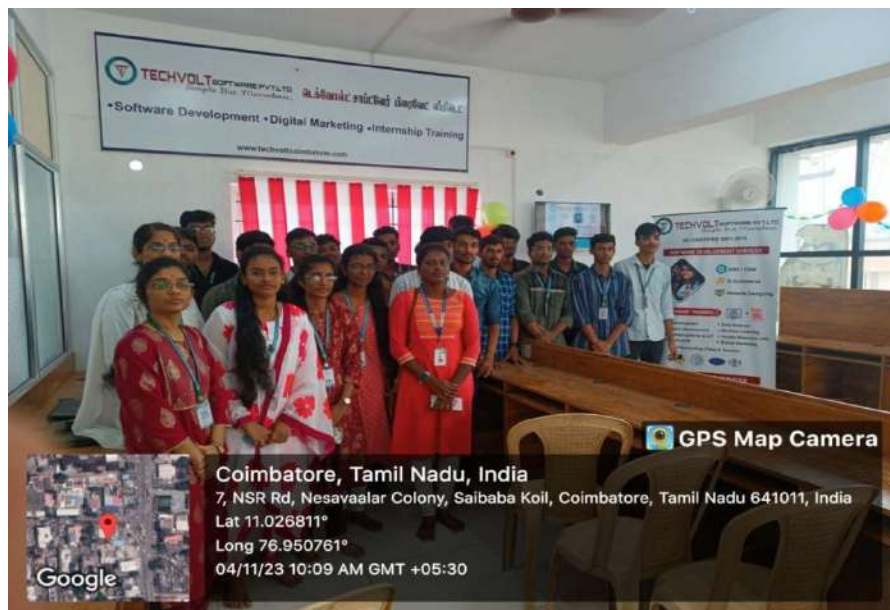
Industrial Visit for the Second Year CSE Students on 04.11.23 to the company “ TECH VOLT SOFTWARE PRIVATE LTD ” Technology in Coimbatore for one day.