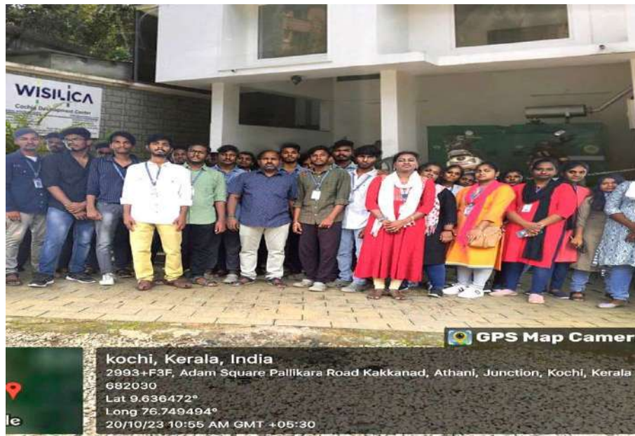
Students of THIRD year CSE(ICB) went for an Industrial Visit to the company “ WISILICA ” INDIA pvt.ltd” on 20.10.2023 and 21.10.2023