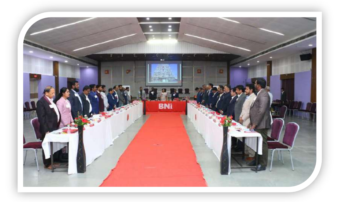
The Department organized a Business Meet "BNI DAFFODILS" for MBA II year students on 10<sup>th</sup> March 2023