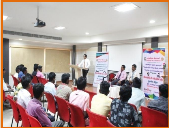
Principal discussing about the importance of PMKVY to the participants.