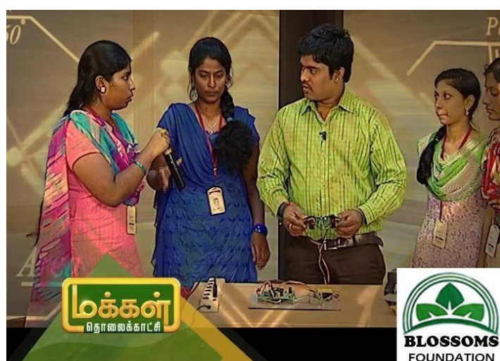
III YEAR V SEMESTER CSE DEPT.