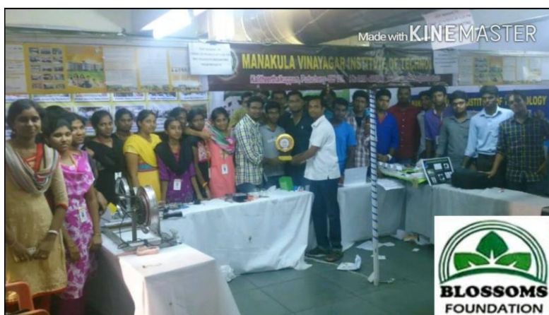
Projects from CSE Department have been exhibited in the Computer Expo-2016 held at Jayaram Thirumana Mandapam, Puducherry on 25,26,27-9-2015. MVIT has bagged the First prize - Best stall award.