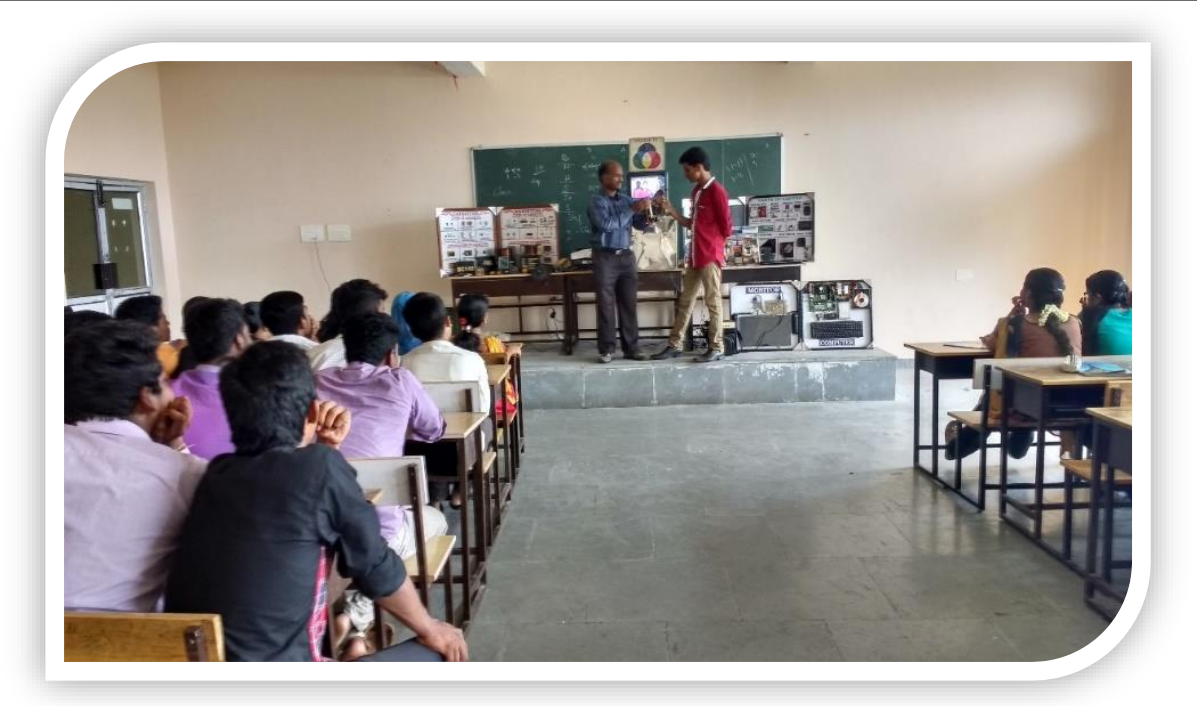
Electronics Raja, Cuddalore, has deliverd a guest lecture on "EDC & DSD related work models" for II year students on 30.8.16