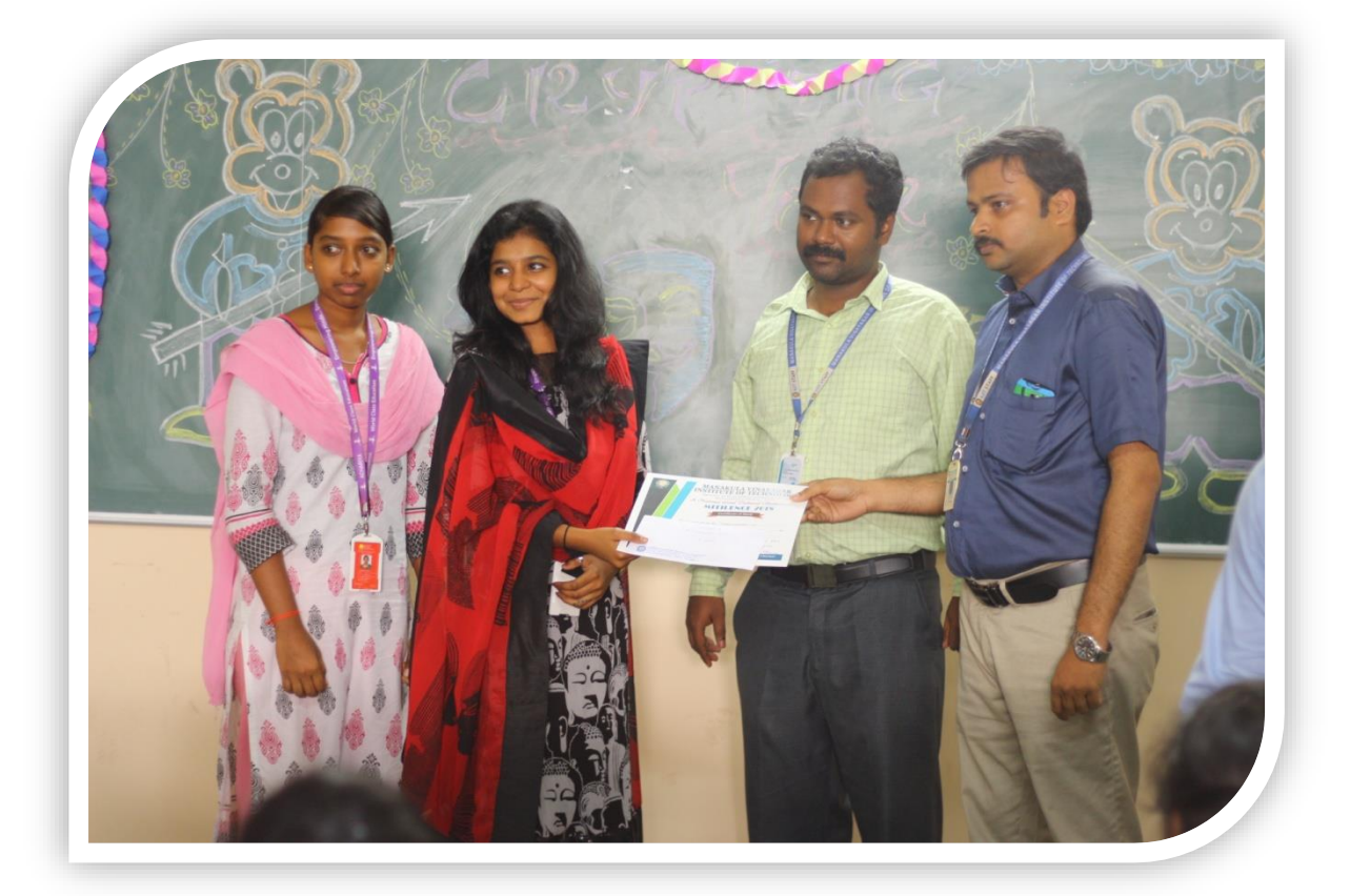
Paper presentation prize distribution in MITILENCE'18-CAPTCHA