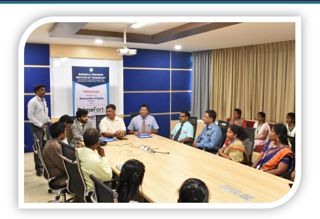
MoU signed with PrimeFort Pvt Ltd