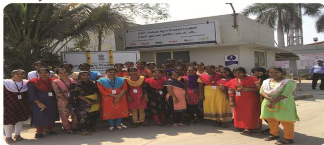
An Industrial Visit to M/s Hutson Agro Ltd Chennai, was arranged for the Final Year students by the Department during the month of February 2020