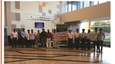
VOLTECH CAMPUS DRIVE