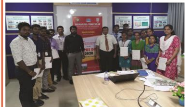
SURETI CAMPUS DRIVE