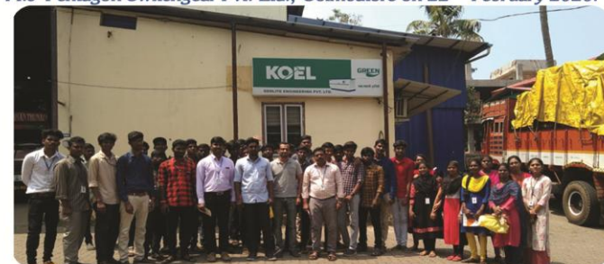
The Second year and Third year students has visited to Genlite Pvt. Ltd., Ernakulum Kerala on 23 rd February 2020.