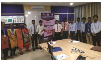
PARAGON CAMPUS DRIVE