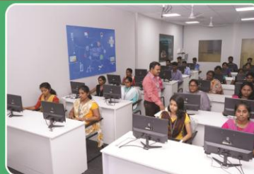
Texas Instruments Lab