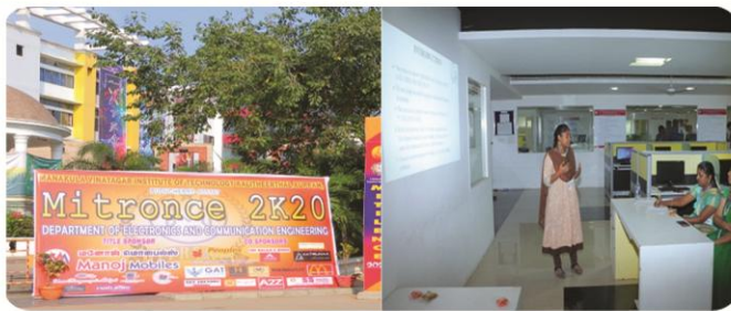
A National Level Technical symposium MITRONCE 2K20 has been organized by Department of ECE on 14 th and 15 th February 2020.