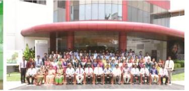
PLACED STUDENTS - 2020 BATCH