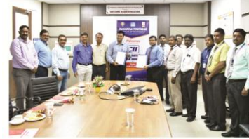
CII - Yi - MoU