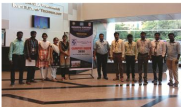
SURESOFT CAMPUS DRIVE