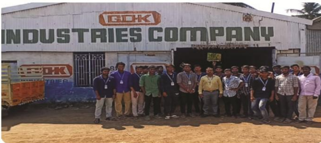
Industrial Visit has been arranged for the Final Year Mechanical students to M/s GDK Industries on 7 th March 2020.