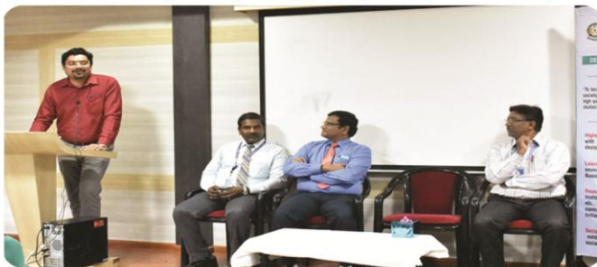
The Department organized Three Days Workshop on "Business Communication" in association with Makeintern.com for the First Year MBA Students from 27 th to 28 th November 2019