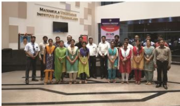
GAVS CAMPUS DRIVE