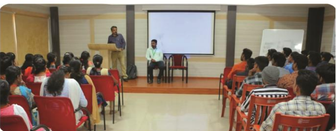
A One Day Workshop on "IOT Using Python" has been organized in association with SLN Technologies Chennai on 21 st February 2020