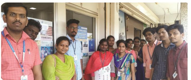
An Industrial visit to "Beta Technologies" Coimbatore for the Third Year students on 14 th and 15 th March 2020.