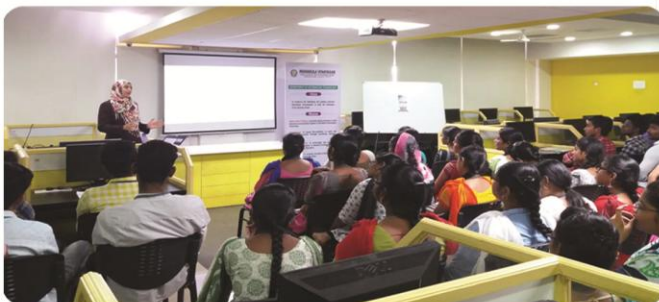
Guest Lecture on "Software Development and Automation" has been organized for Third year students on 22 nd February 2020.