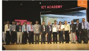
ICT ACADEMY AWARD