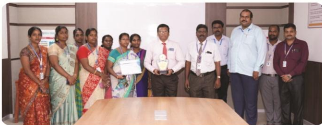
Our Institution was awarded with the prestigious award "Best Accredited Student Branch" by the technically renowned Computer Society of India amongst all associated peer institutions in and across Puducherry Region