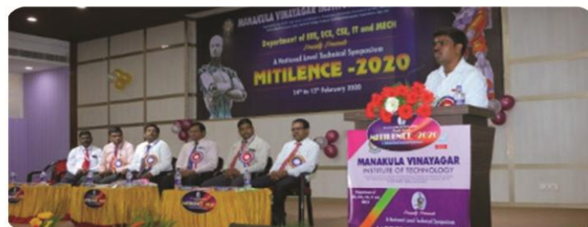
The Department organized National Level Technical Symposium- MITILENCE '20 on 14 th to 15 th February 2020.