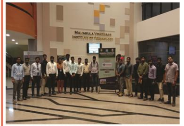
E CON SYSTEMS CAMPUS DRIVE