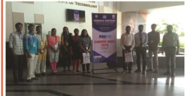
PAYTM CAMPUS DRIVE