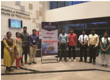
EXCELLACOM CAMPUS DRIVE