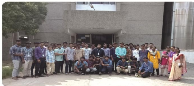
The Second Year and Final year students has visited to "Aavin cooperative society , Villupuram on 19 th February 2020