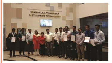
CHOLAMANDALAM CAMPUS DRIVE