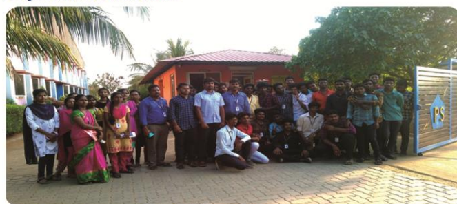
The Second year and Third year students went to an Industrial Visit to M.s Pentagon Switchgear Pvt. Ltd., Coimbatore on 22 nd February 2020.