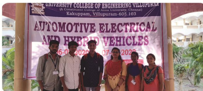
Third Year Students have attended Two days Workshop on "Automotive Electrical and Hybrid Vehicles" at Anna University, Villupuram on 06 th 7 th February 2020.