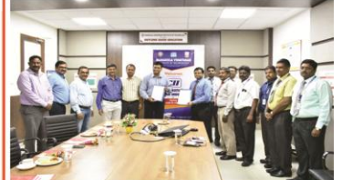
CII - MoU