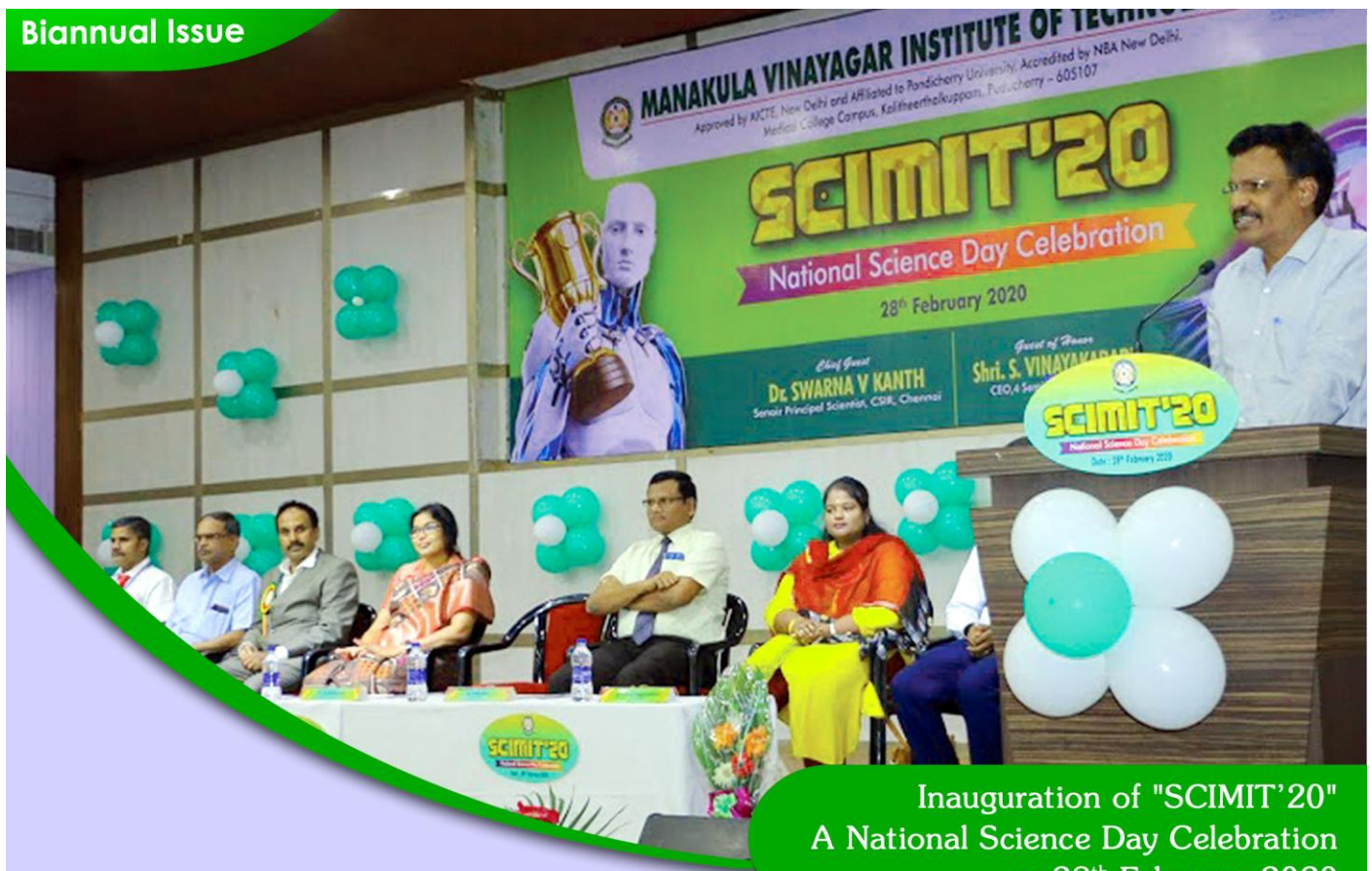
Inauguration of "SCIMIT'20" A National Science Day Celebration on 28 th February 2020.