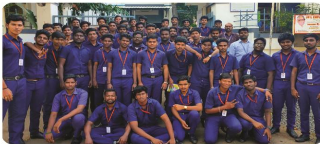
The Second Year Mechanical Engineering students visited M/s UCAL Polymer Industries on 8 th February 2020.