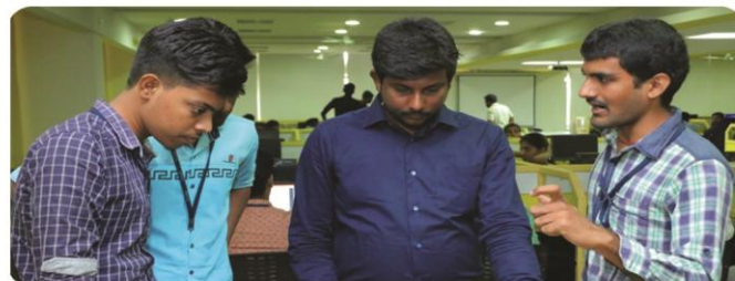
An Inter-Collegiate "Android Application Project Contest" 2019 has been organized by IT Department at MVIT, Puducherry on 5 th March 2020.