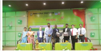
MoU - Centre of Excellence