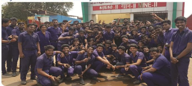
The Third Year Mechanical Engineering students visited M/s "NLC Mines" on 5 th March 2020.