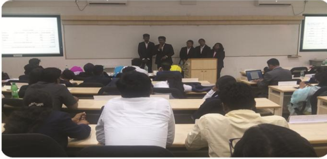
A Team of First Year consisting Five students Presented a Business Plan on "Application of Hologram in Restaurants" at IIM Bangalore on 30 th December 2019