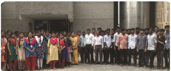
An Industrial visit to Aavin Villupuram for the Second Year students on 27 th February 2020.