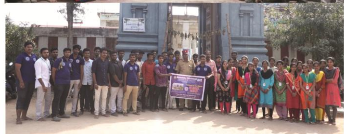
MVIT – National Service Scheme Special Camp at Government High School, Kalmandapam, Puducherry on 27 th January 2020 to 2 nd February 2020