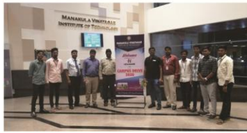
HEXAWARE CAMPUS DRIVE