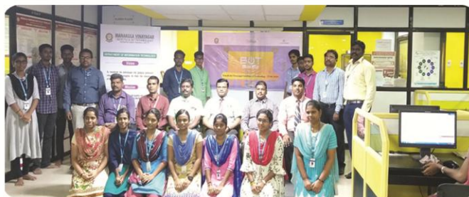
Two Days Online Certification Course on "Automation Anywhere", in association with ICT Academy, Puducherry has been organized for Final year Students on 10 th to 11 th February 2020 and for Second and Third year Students on 27 th & 28 th January 2020.