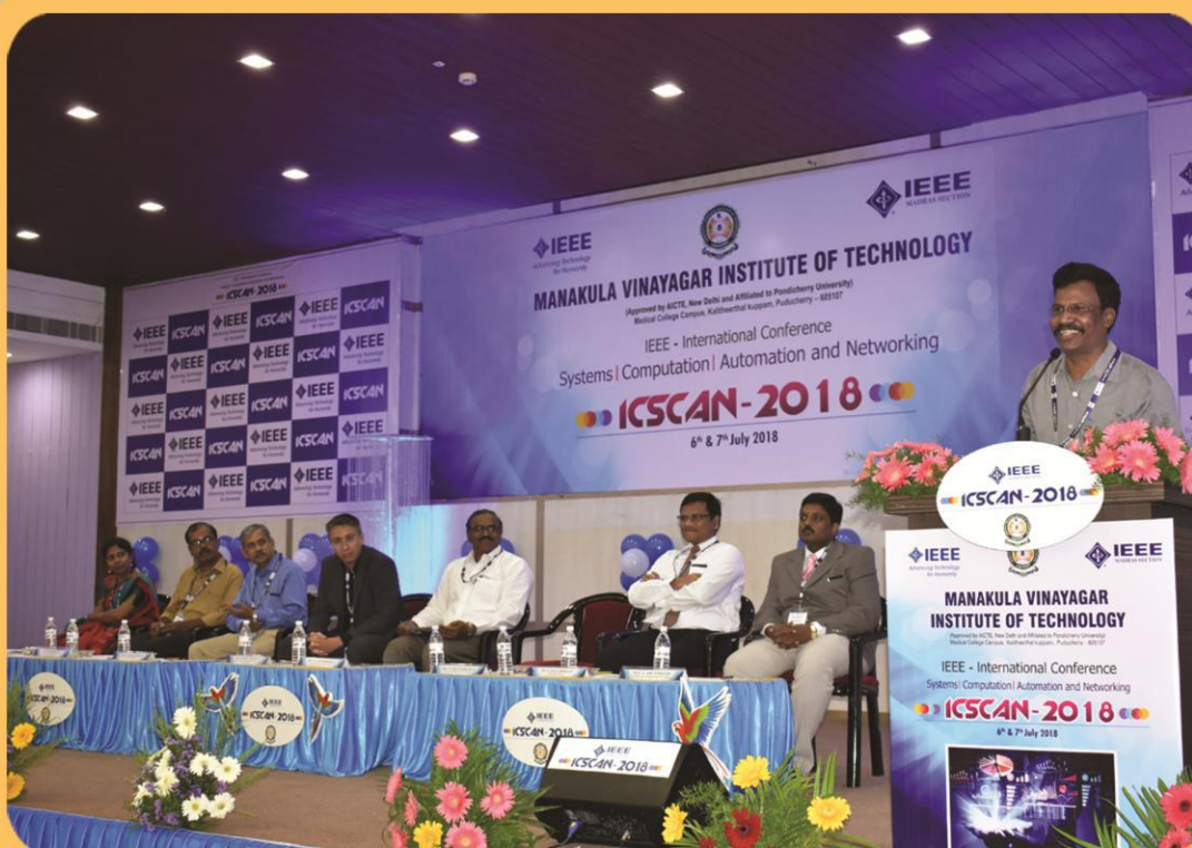
IEEE - ICSCAN 2018 on 6 th & 7 th July 2018

(International Conference on Systems, Computation, Automation and Networking)