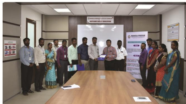
The Department signed MoU with GGM Technology India Pvt. Limited on 3 rd September 2018