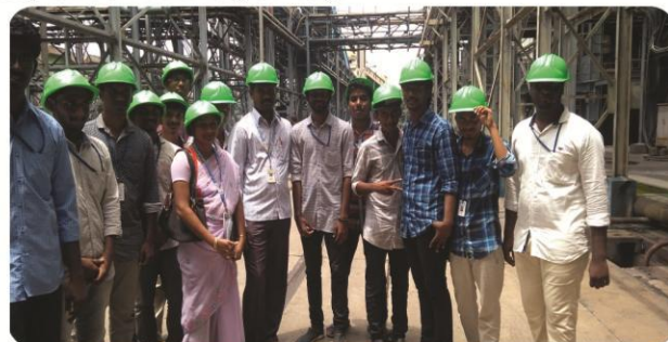
An Industrial Visit to “M/s Mettur Thermal Power Station, Mettur by Third year students on 1 st and 5 th September 2018.

III ECE A and B section students have gone for industrial visit to Mettur Thermal Power Station, Mettur on 1 st and 5 th September 2018 respectively.