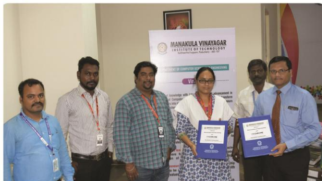
Signed MoU with TRICHROME Technologies on 16 th July 2018