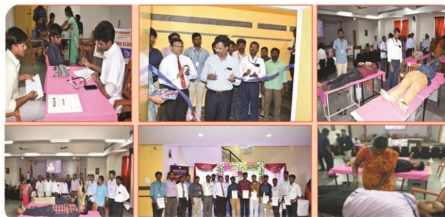
Blood Donation Camp during Founder's Remembrance Day

in the nearby school, Distribution of foods to the Citizen Homage in Pondicherry and Sapling of Tree Plantation were organized .