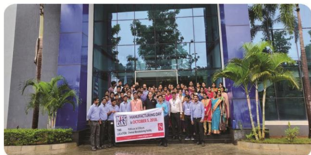
The Final year students visited American Axle Manufacturing India Pvt. Ltd., Chennai on 5 th October 2018.

The Department coordinated ICSCAN 2018 - International Conference on Systems, Computation, Automation and Networking, an IEEE international Conference which was conducted on 6 th and 7 th July 2018.