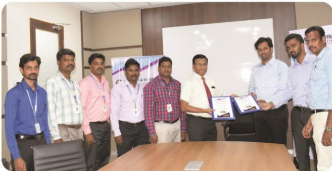
The Department Signed the Memorandum of Understanding (MOU) with Cherri Technologies, Puducherry at MVIT on 30 th July 2018.