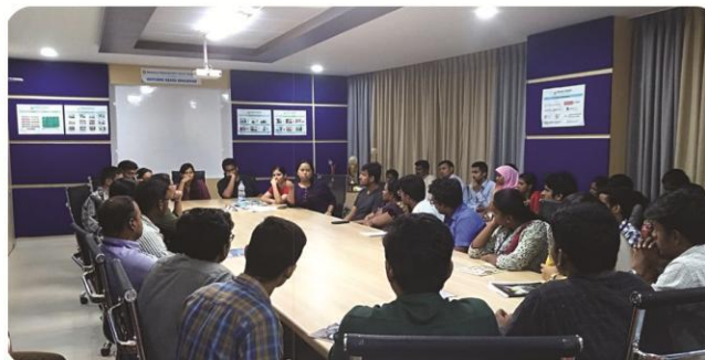
The Department organized an Interactive Session with Research Scholars of Computational Neuroscience Lab, Department of Biotechnology, IIT Madras on 8 th September 2018.