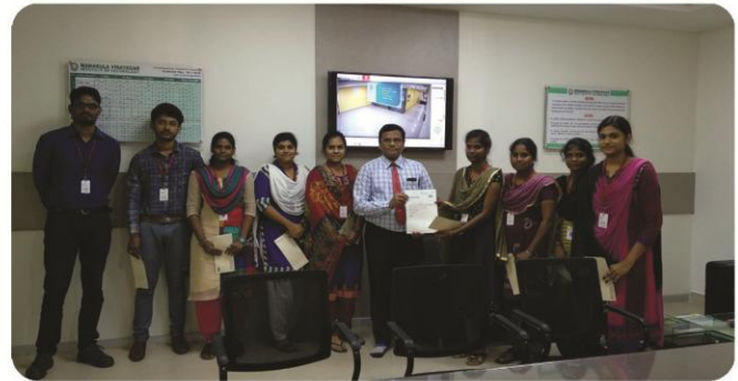
The Department arranged Two Weeks Internship for the Final Year MBA Students at M/s Rane Madras Ltd, Puducherry during the month of September & October 2018.