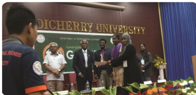
The Final and the First Year MBA Students participated in GLOBBIZ'18 an Industry – Institute Interface Meet organized by Pondicherry University on 26 th October 2018 and won First Prize in the Event “ Best Entrepreneurs” and Second Prize in the event “ Business Quiz”.

MBA Second Year Students attended the HR Colloquium titled on “TECH HUMANS” held at IIT, Chennai.