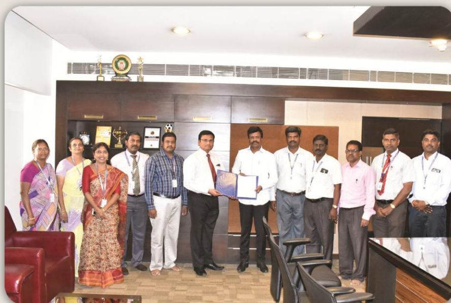
Accreditation by National Board of Accreditation (NBA), New Delhi.

Greetings from Manakula Vinayagar Institute of Technology, Puducherry