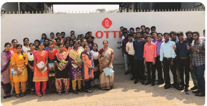
An Industrial Visit was organized for MBA First Year Students at M/s Lotte India corporation, Nellikupam on 15 th October 2018.