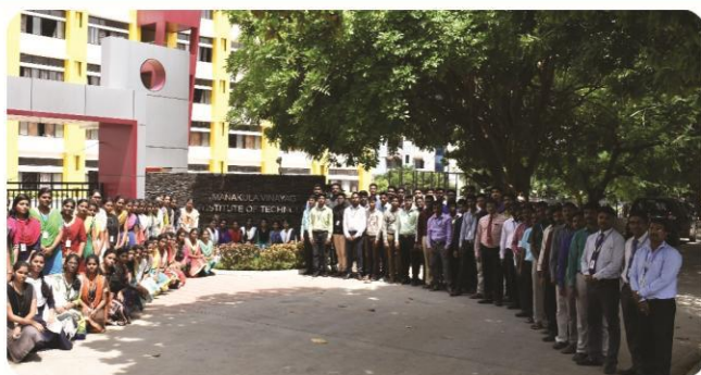
Thirty students of MVIT bagged Job Offers with the CTC of 3.36 lakhs per annum through TCS Ninja Recruitment drive held at Chennai on 18 th September 2018.