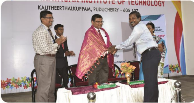
"Induction Day" for 10 th Batch of MBA students was organized by the Department on 4 th October 2018