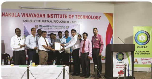
Inauguration of "Indian Society of Heating, Refrigerating and Air-Conditioning Engineers" ISHRAE Students chapter at MVIT, on 29 th July 2018