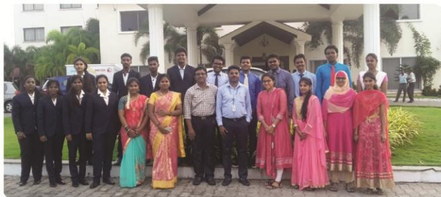
The Second Year students Participated in Annual Convention Meet, conducted by Puducherry HR Circle at Hotel Grand Serena, Puducherry