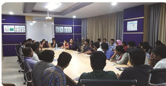
The Department organized an Interactive Session with Research Scholars of Computational Neuroscience Lab, Department of Biotechnology, IIT Madras on 8 th September 2018.