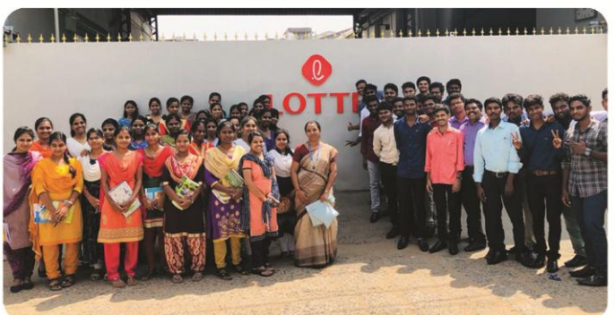
An Industrial Visit was organized for MBA First Year Students at M/s Lotte India corporation, Nellikuppam on 15 th October 2018.