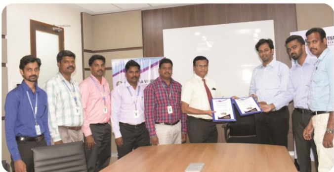
The Department Signed the Memorandum of Understanding (MOU) with Cherri Technologies, Puducherry at MVIT on 30 th July 2018.