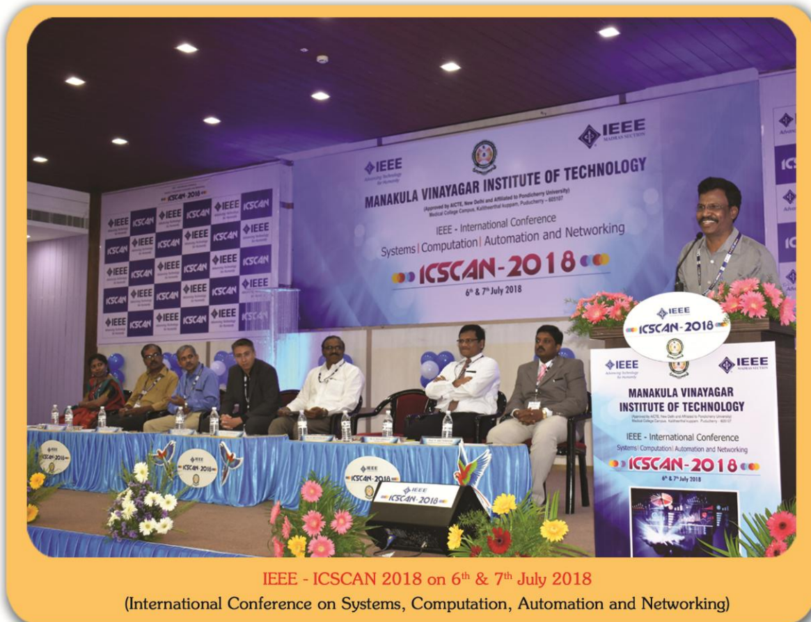
IEEE - ICSCAN 2018 on 6 th & 7 th July 2018

(International Conference on Systems, Computation, Automation and Networking)