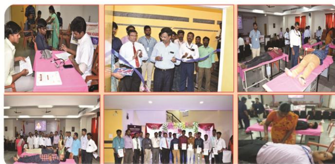
Blood Donation Camp during Founder's Remembrance Day

in the nearby school, Distribution of foods to the Citizen Homage in Pondicherry and Sapling of Tree Plantation were organized .