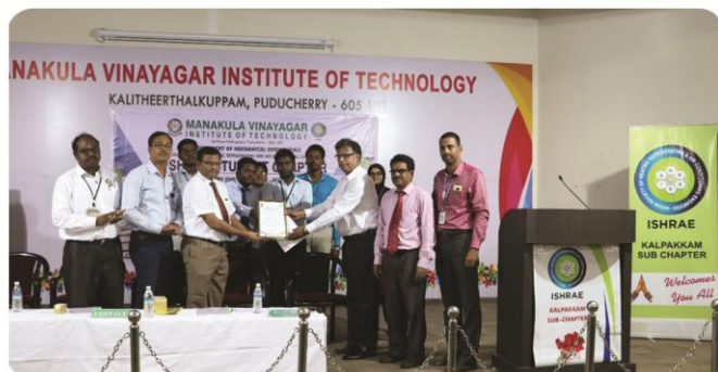
Inauguration of "Indian Society of Heating, Refrigerating and Air-Conditioning Engineers" ISHRAE Students chapter at MVIT, on 29 th July 2018