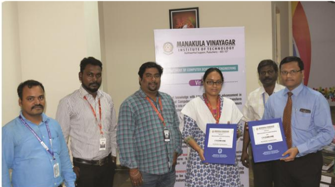
Signed MoU with TRICHROME Technologies on 16 th July 2018