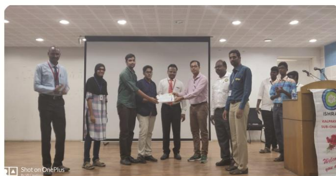
The Faculty members & students Participated in One Day Workshop on “Refrigerants and its Application” at JPR Institute of technology Chennai on 29 th September 2018