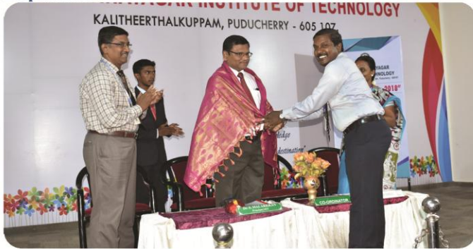
"Induction Day" for 10 th Batch of MBA students was organized by the Department on 4 th October 2018