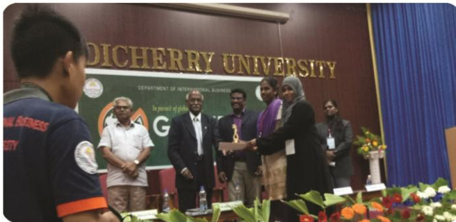
The Final and the First Year MBA Students participated in GLOBBIZ'18 an Industry – Institute Interface Meet organized by Pondicherry University on 26 th October 2018 and won First Prize in the Event “ Best Entrepreneurs” and Second Prize in the event “ Business Quiz”.

MBA Second Year Students attended the HR Colloquium titled on “TECH HUMANS” held at IIT, Chennai.