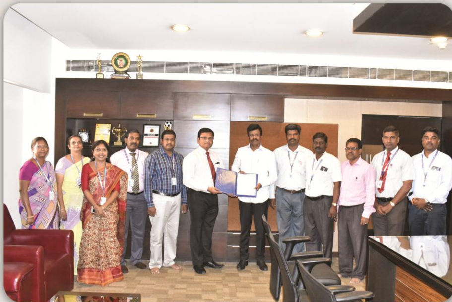
Accreditation by National Board of Accreditation (NBA), New Delhi.

Greetings from Manakula Vinayagar Institute of Technology, Puducherry