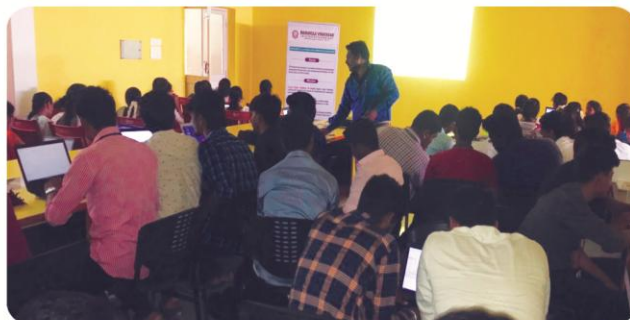
A One Day Workshop on “Python Programming” by NIIT Trainers, was organized for the Second and the Third students on 18 th July 2018

III ECE A and B section students have gone for industrial visit to Mettur Thermal Power Station, Mettur on 1 st and 5 th September 2018 respectively.