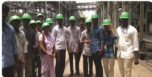
An Industrial Visit to “M/s Mettur Thermal Power Station, Mettur by Third year students on 1 st and 5 th September 2018.

III ECE A and B section students have gone for industrial visit to Mettur Thermal Power Station, Mettur on 1 st and 5 th September 2018 respectively.