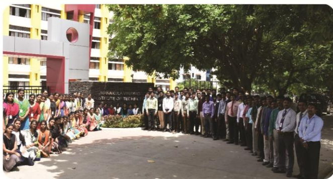
Thirty students of MVIT bagged Job Offers with the CTC of 3.36 lakhs per annum through TCS Ninja Recruitment drive held at Chennai on 18 th September 2018.