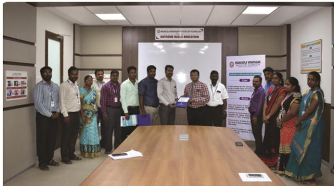
The Department signed MoU with GGRM India Private Limited on 3 rd September 2018