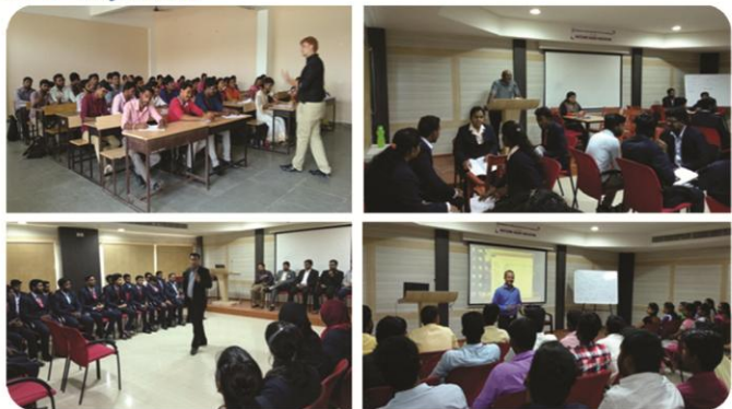
The Training Programmes on "Aptitude and Soft Skills" by eminent Trainers, organized by the Department for the Final Year MBA students during the Month of September 2018.