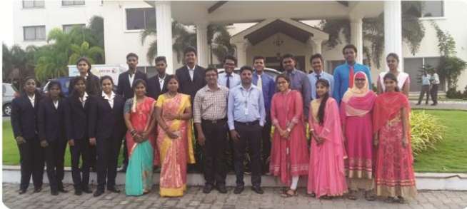
The Second Year students Participated in Annual Convention Meet, conducted by Puducherry HR Circle at Hotel Grand Serena, Puducherry