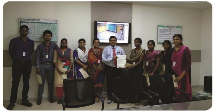
The Department arranged Two Weeks Internship for the Final Year MBA Students at M/s Rane Madras Ltd, Puducherry during the month of September & October 2018.