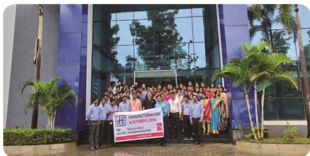
The Final year students visited American Axle Manufacturing India Pvt. Ltd., Chennai on 5 th October 2018.

The Department coordinated ICSCAN 2018 - International Conference on Systems, Computation, Automation and Networking, an IEEE international Conference which was conducted on 6 th and 7 th July 2018.