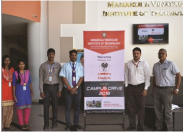
MRF CAMPUS DRIVE