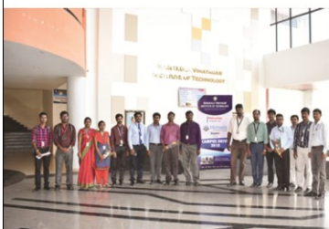
MPHASIS CAMPUS DRIVE