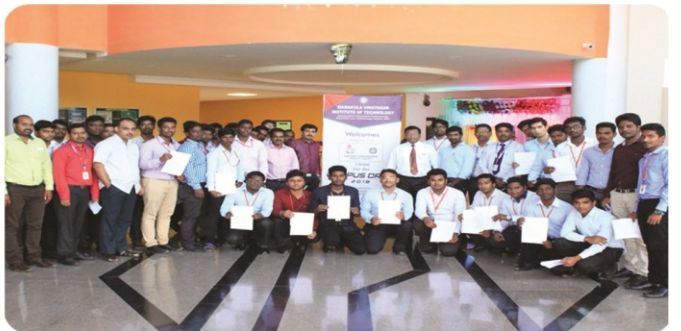
35 Students of Batch : 2014-18 were placed by the Department at "M/s Infant Engineers Pvt Ltd.", Chennai.