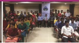
SALES FORCE TRAINING