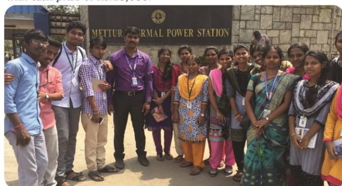
The Department organized an Industrial visit to "Mettur Thermal power station" for the Third Year students on 14 th February 2018.