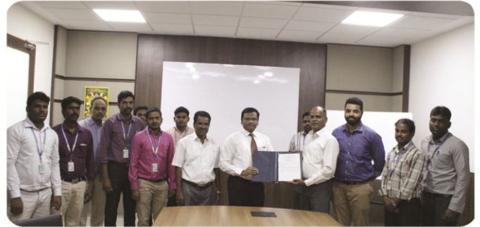
The Department signed MOU with HEXDOF Engineering Services Pvt. Ltd on 20th January 2018