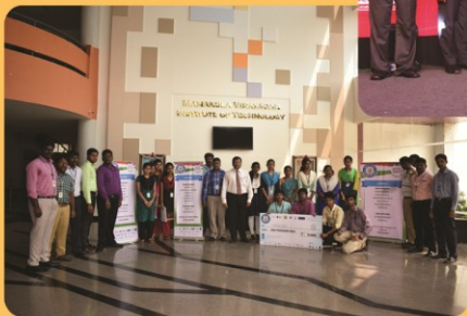
Ten teams participated in SMART INDIA HACKATON 2017 and won Persistent Award