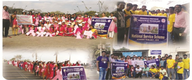
The NSS Cell of MVIT organized an International Childhood and Breast Cancer Awareness Rally at Puducherry. The Rally was inaugurated by Puducherry Lt. Governor Kiren Bedi, on 4 th February 2018.