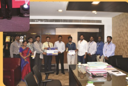
2 nd & 4 th Prize winner of ZOHO – CliqTrix Competition