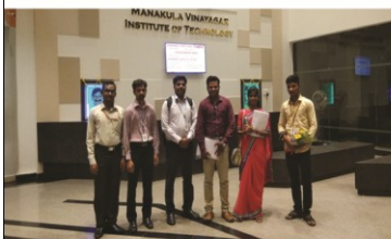
LSE CAMPUS DRIVE