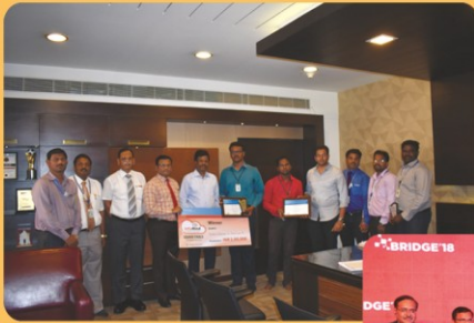
Winner of TCS – InfraMind Competition