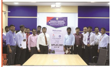
INFANT ENGINEERS CAMPUS DRIVE