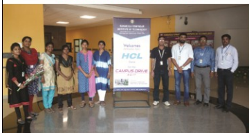
HCL CAMPUS DRIVE