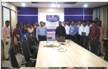
SUTHERLAND CAMPUS DRIVE