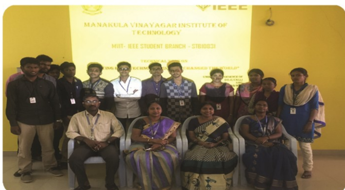
The MVIT- IEEE Student Branch organized Tech-Talk competition titled "Cutting Edge Technologies that changed the World" for the First, Second & Third Year Students on 7 th February and 19 th February 2018.