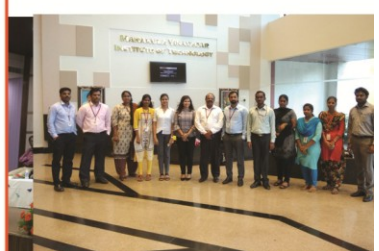
LUMINA DATAMATICS CAMPUS DRIVE