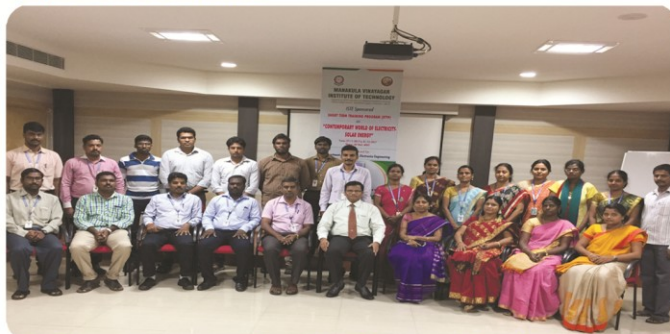
The Department organized an ISTE Sponsored One Week Short Term Training Program (STTP) on "Contemporary World of Electricity – Solar Energy" from 27 th November 2017 to 1 st December 2017