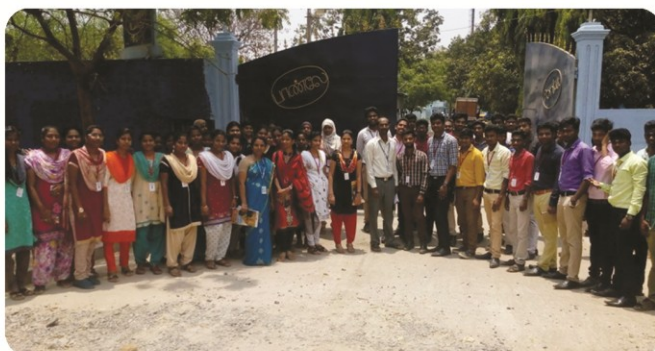
An industrial visit to M/s Ponlait Ltd was arranged by the Department for the First Year students on 6 th April 2018.