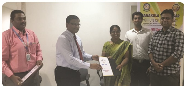
The Department signed a MoU with ABE Semiconductor Designs, Chennai on 15 th December 2017