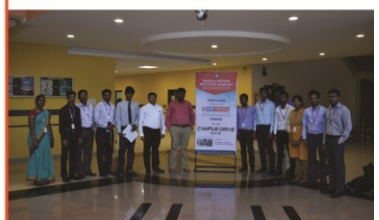
IDBI CAMPUS DRIVE