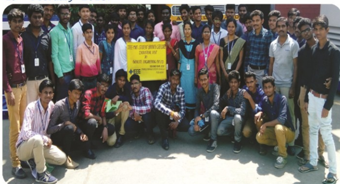
The Department organized an Industrial visit to "M/s Genlite engineering Pvt Ltd,Chennai" for the Second Year students on 24 th February 2018.