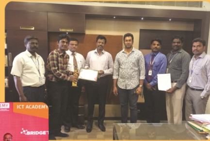
Winner of VIRTUSS-Neural Hack Competition