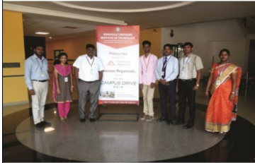
AMI CAMPUS DRIVE