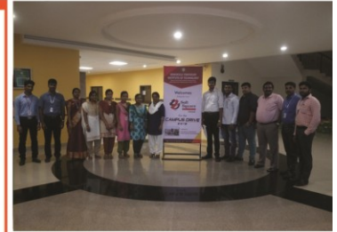
SOFTSQUARE CAMPUS DRIVE