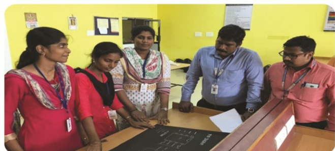
The Department conducted a “Mini Project Expo” for the ECE students on 12 th March 2018

The Department organized an Industrial Visit to “M/s BSNL”, Meenapakkam, Chennai” on 3 rd March 2018.