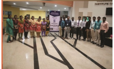
SURESOFT CAMPUS DRIVE