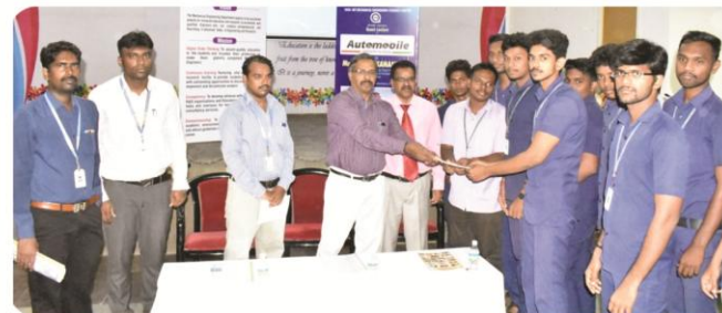
The Third Year students were awarded and appreciated for winning the Quiz Competition organized by the Department on 21 st September 2019

The Second, Third and Final year students were awarded and appreciated for their participation in World Environmental Cycle rally on 5 th July 2019