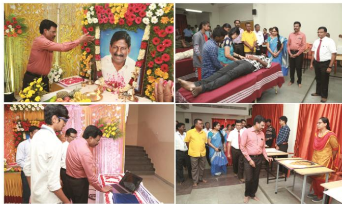
Blood Donation Camp during Founder's Remembrance Day

in the nearby school, Distribution of foods to the Citizen Homage in Pondicherry and Sapling of Tree Plantation were organized.