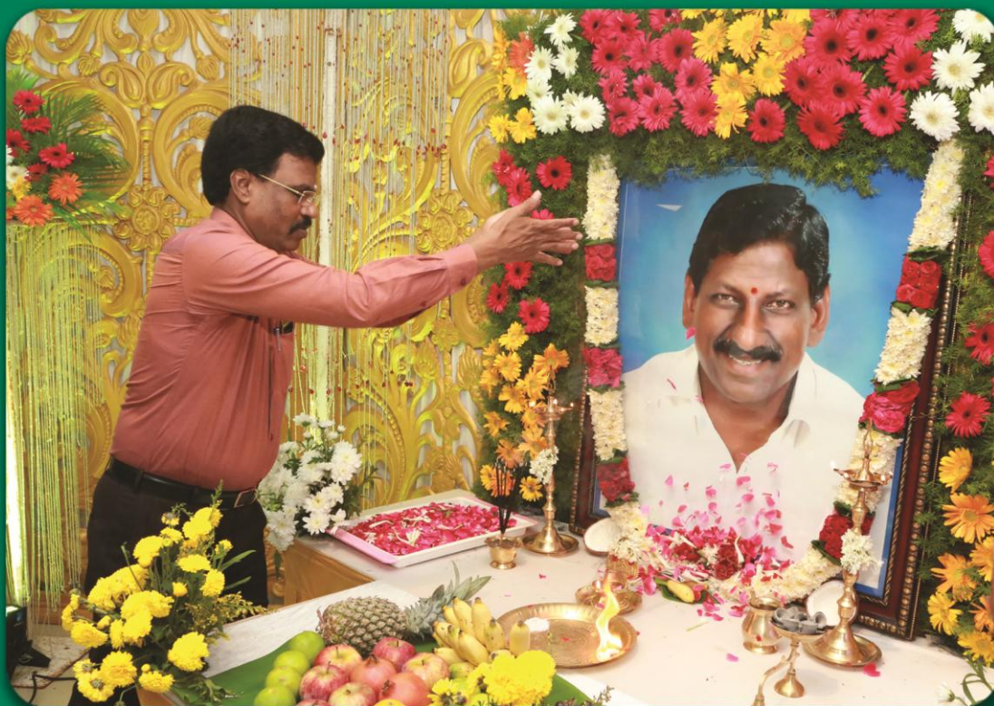
Founder's Eighth Remembrance day on 6 th September 2019