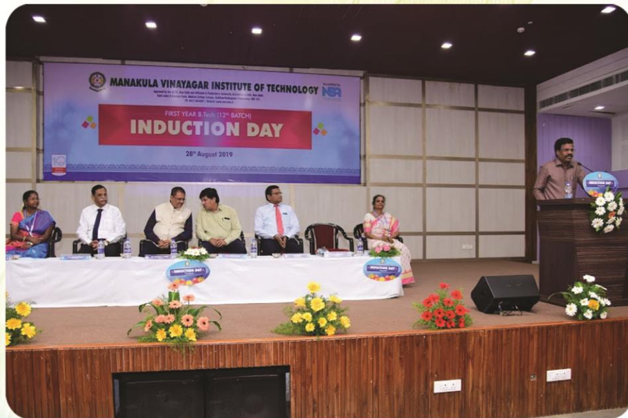
First Year B.Tech (12 th Batch) Induction Day Celebration on 28 th August 2019

Manakula Vinayagar Institute of Technology, Puducherry