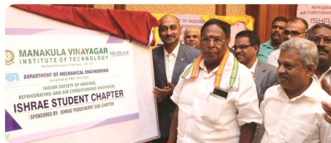
The Hon'ble Chief Minister Dr.K. Narayanasamy inaugurated ISHARE student Chapter and also inaugurated the ISHRAE 24 th +1 st Awareness Campaign on at Hotel ACCORD, Puducherry on 18 th August 2019.