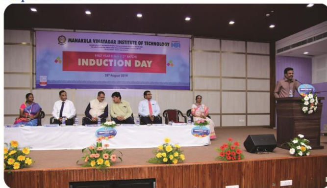
The Inauguration of B.Tech First Year (12 th batch) was organized on 28 th August 2019.