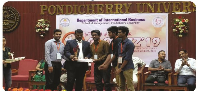
The First Year students won First Prize in the events "Best Entrepreneur", Treasure Hunt & Best Finance" in an Industry – Institute Interface Meet "GLOBIZZ'19" organized by Department of Management Studies, Pondicherry University, on 24 th October 2019.