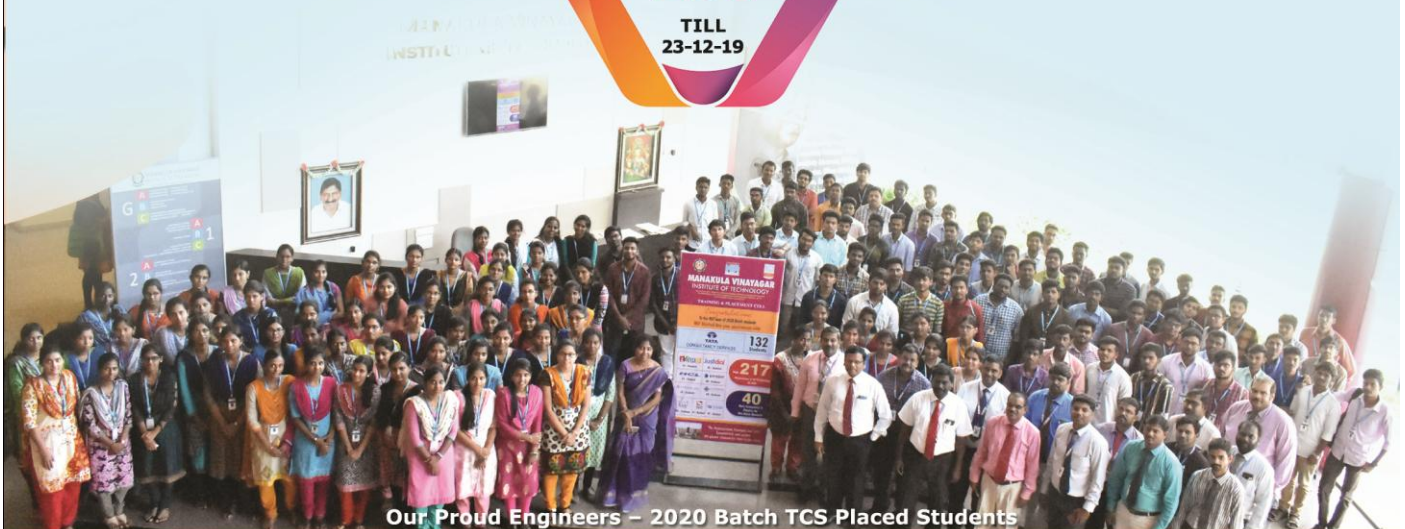
Our Proud Engineers – 2020 Batch TCS Placed Students