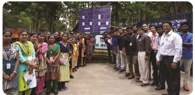
An Industrial Visit to M/s Ranae Brake Linings Ltd, Puducherry for the Second Year Students on 28 th August 2019.

The First Year students won First Prize in the event "Best Entrepreneurs" in the Intercollegiate competition held at Pondicherry University on 24 th October 2019.