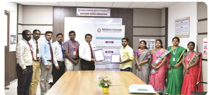
The Department Signed Memorandum of Understanding with M/s EmCog Solutions, Chennai on 28 th June 2019