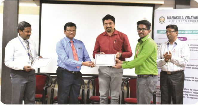
The Department of Management Studies conducted a Three Days workshop on Business Communication", associated by Makeintern.com, for the First year students on 27 th and 28 th November 2019.