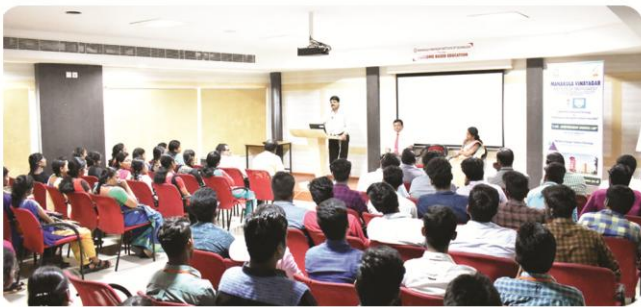
R & D Cell organized DST-NIMAT Sponsored "ENTREPRENEURSHIP AWARENESS CAMP (EAC)" at MVIT from 26 th to 28 th September 2019.