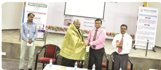
The Department arranged a One day Workshop on "Logistics and its Applications in Industries" on 22 nd Jul 2019.