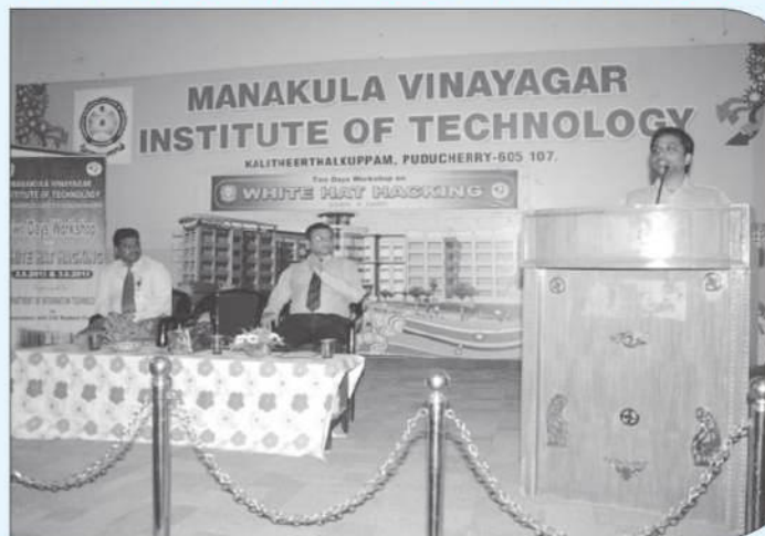
Two days workshop on “White Hat Hacking” was organized in association with CSI Students Chapter.