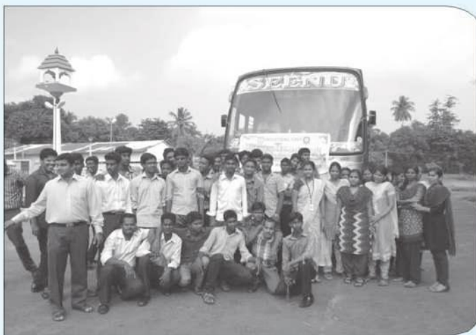
MBA Students and Faculty during Industrial Visit at M/s Neyveli Lignite Corporation Ltd., Neyveli.