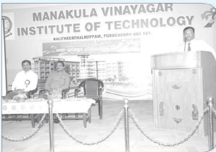
AICTE sponsored two weeks Faculty Development Programme on "Recent Advances in Artificial Neural Networks" was organized by CSE Department