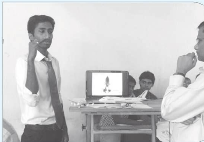
Students elucidating their Project Display to the Principal on “e-CARNIVAL” programme on 5 th September, 2013.