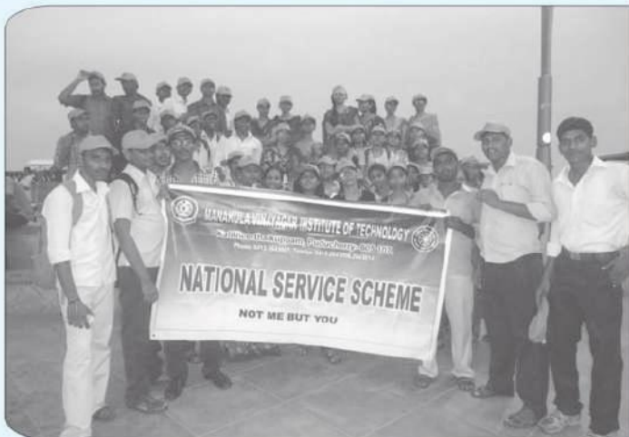
NSS Volunteers participating in a Rally to commemorate Swami Vivekananda's Birthday.

A "Nutritious Awareness Programme" was conducted to the Middle School Students of Kothapurinatham on 10 th June, 2013.