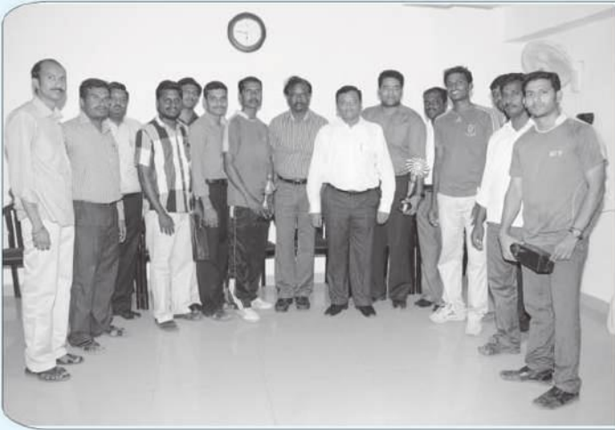
A Team of MVIT Staff with the winning trophy in the "MVIT Rolling Trophy, an Intercollegiate Tournament" for Cricket & Volley ball.

Prize among the sixteen colleges on 17 th and 18 th September, 2013.