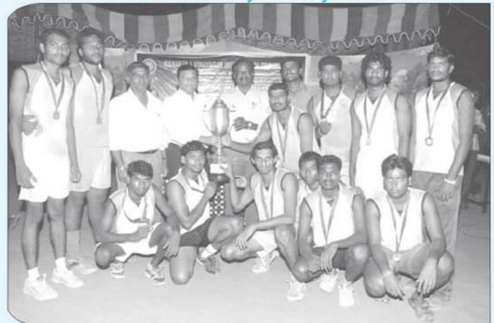
A Team of MVIT students receiving the trophy for Winning in the "Pondicherry Intercollegiate Volley ball Tournament"