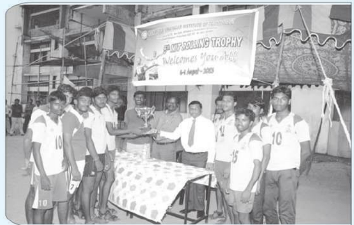
A Team of MVIT students receiving the trophy for Winning in the "MVIT Rolling Trophy, an Intercollegiate Tournament" for Volley ball