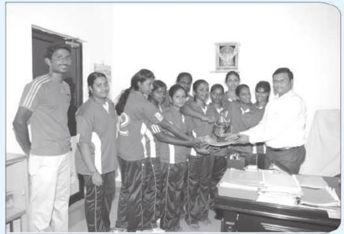
A Team of MVIT students receiving the trophy for winning third place in the "MVIT Rolling Trophy, an Intercollegiate Tournament" for Throw Ball.