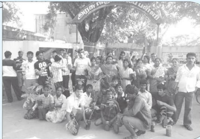
A "Nutritious Awareness Programme" was conducted by NSS Volunteers to the Middle School Students, Kothapurinatham

The Team has organized an awareness programme on "The Importance of Voter ID Enrolment" on 12 th October, 2013.