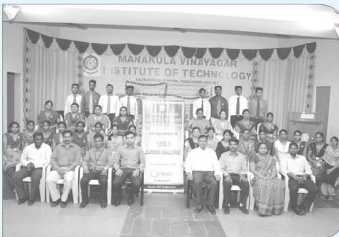
Participants of "Level 5 Learning Contest" organized by M/s Classle, Chennai

Our Training and Placement cell is committed to provide all possible assistance to the Engineering and Management students in their efforts to find employment. It assists in arranging pre-placement talks, written tests, group discussions, personal interviews, etc., Off-campus interviews are also arranged regularly. The training and placement cell also invites Industry Professionals to interact with students in order to identify the emerging opportunities in the corporate world.