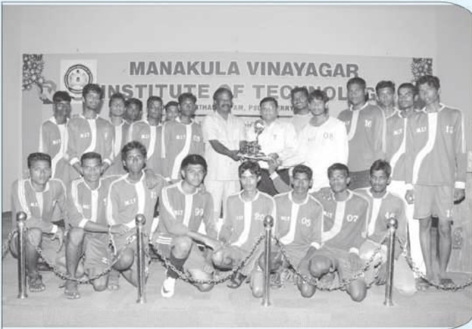
A Team of MVIT students receiving the trophy for Runner-up in the "MVIT Rolling Trophy, an Intercollegiate Tournament" for Football

Our college students thrived the pride of winning the trophy in the "Pondicherry Inter-collegiate Cricket Tournament" held on 18 th September, 2013.