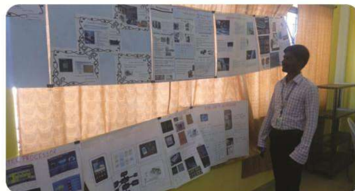
The Poster presentation contest on Application of Electronics” and “Advanced Microprocessor was held at MVIT, on 18 th August 2016