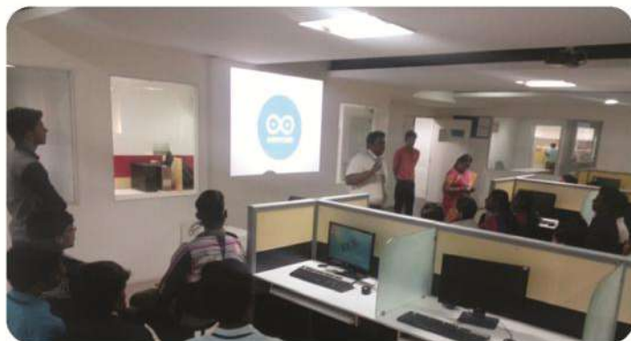
The Workshop on “Arduino” was conducted for the Third Year students on 27 th and 28 th July 2016.

FOSS workshop on “ C and C++ ” was conducted for Third Year students on 23 rd July 2016.