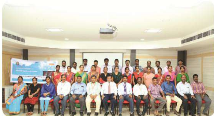
The Department organized an ICTACT Sponsored Two Days Faculty Development Programme on “Mobile Application Development” on 29 th & 30 th June 2016. Totally 32 faculty members from in and around of Puducherry and Tamilnadu Engineering Colleges had participated.