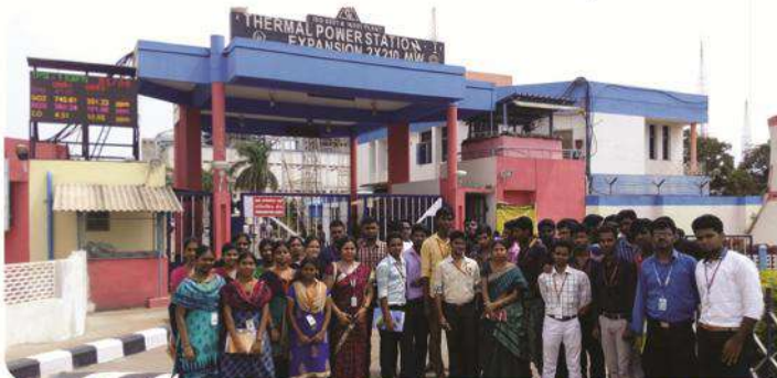
The Third Year students went to an Industrial Visit at "M/s NLC Thermal Power Station" on 1 st August 2016.