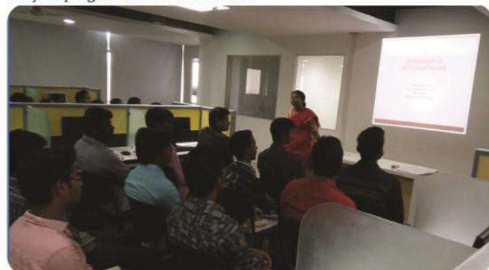
The Department organized a Workshop on "INTRODUCTION AND HANDS ON TRAINING ON MATLAB" for the Final Year students on 1 st July 2016