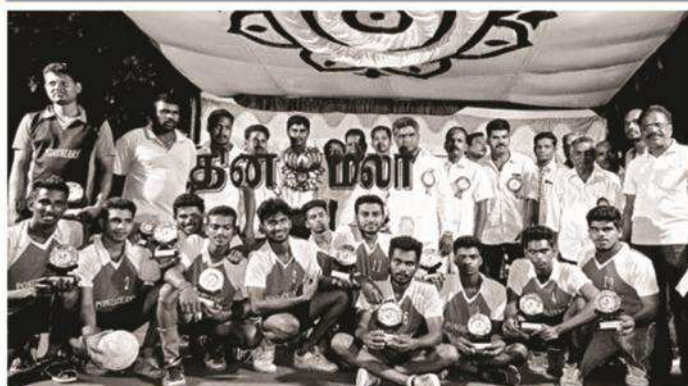
The team of Third Year students/ECE, won First Prize in "Open State Championship Handball" at PS. Palayam Government Higher Secondary School.