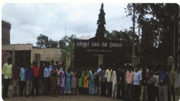
The Second Year students went to an industrial visit to "M/s Ennore Thermal Power Station" on 5 th July 2016.