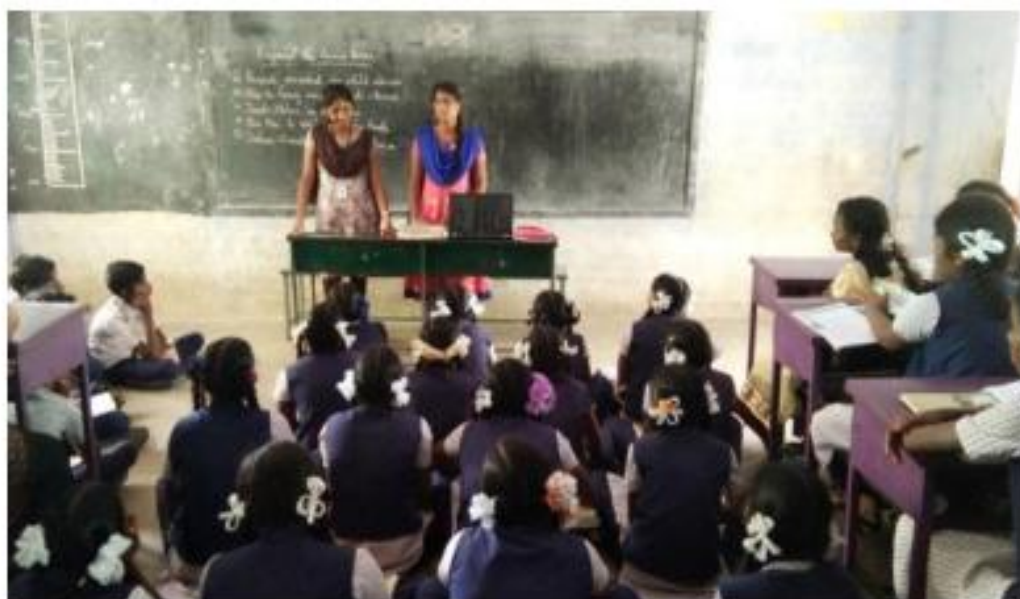
"E-waste management" awareness in Government Higher Secondary School, Veppari