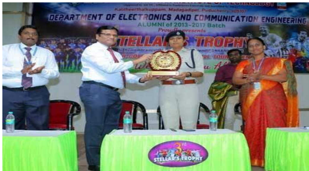
21st February 2020