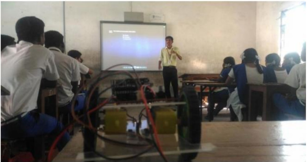
Robotics event in school