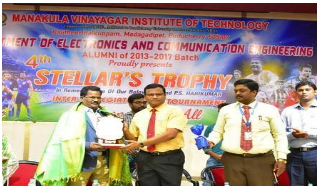
STELLAR'S TROPHY on 05-02-2021 & 06-02-2021