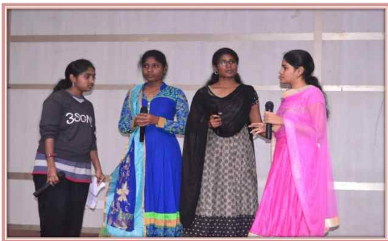
Performance of Alumni during the alumni meet conducted on 23 rd Dec 2017