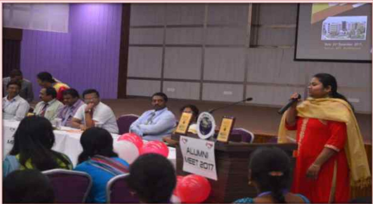
Alumni sharing their experiences during the alumni meet on 23 rd Dec 2017