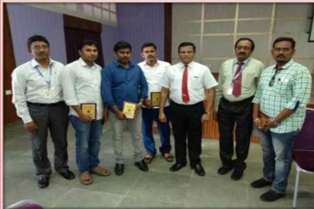
Group Photo sessions during the alumni meet on 23 rd Dec2017