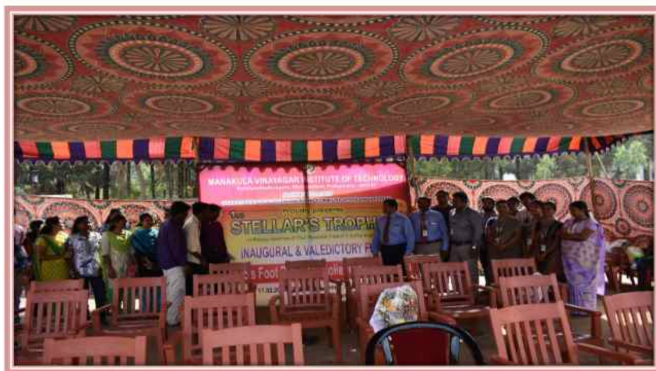
Group Photo session during the alumni 1 st Stellar's Trophy on 17 th Feb 2018.