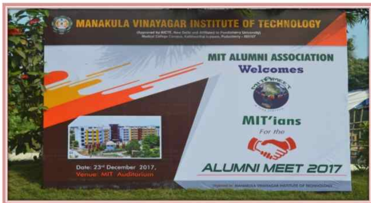
Welcome Note to the Alumni Meet on 23 rd December 2017