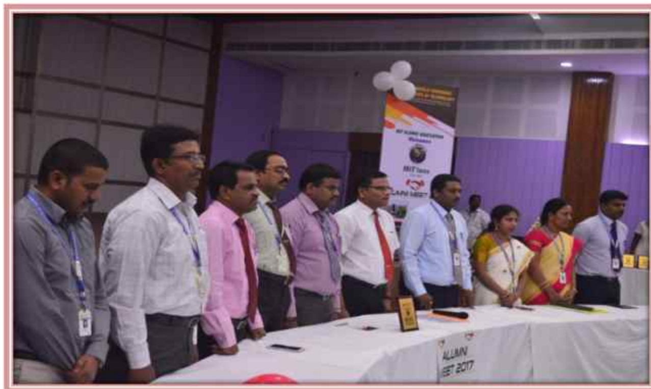
Inauguration ceremony of the alumni meet conducted on 23 rd December 2017