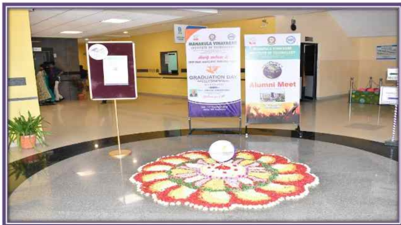
WELCOME NOTE AT THE ENTRANCE FOR THE ALUMNI MEET ON 14.12.2018