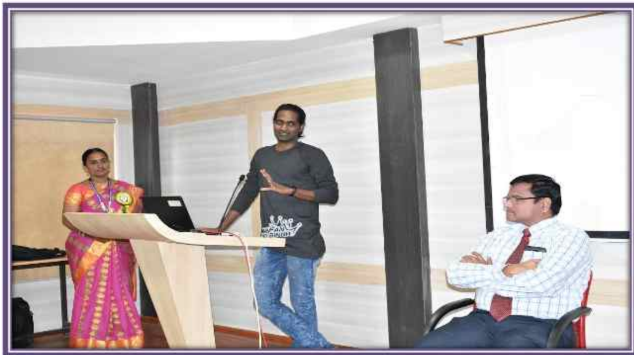
Alumni sharing their job experiences, Industrial Scenario and their challenges in the Alumni meet on 14.12.2018