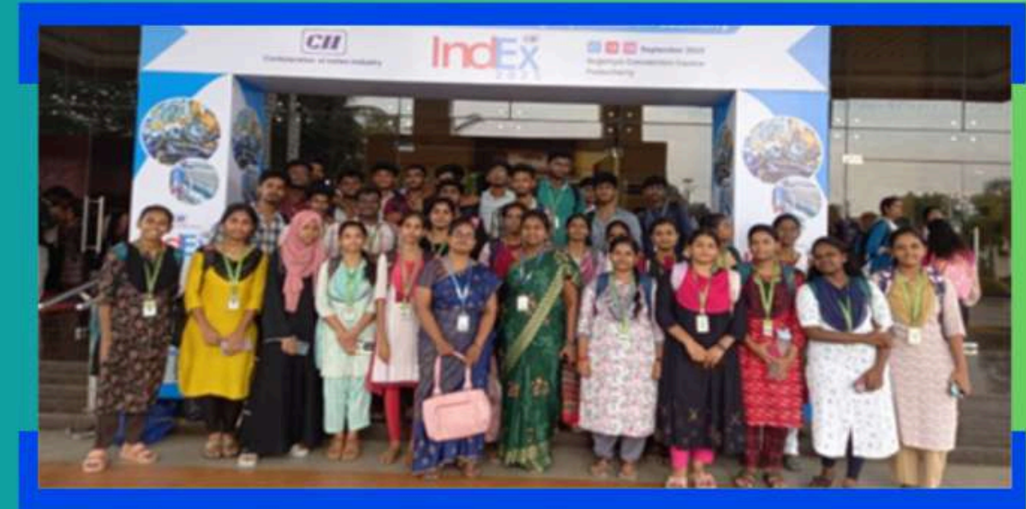
th 11 th IT A&B students visited INDEX 2025 - Industrial Exhibition at Puducherry organised by CII as a part of Industrial visit on 17.9.25

The Industrial visit ensures a respectful, responsible, and inclusive environment by guiding behavior and promoting integrity apart from the institution