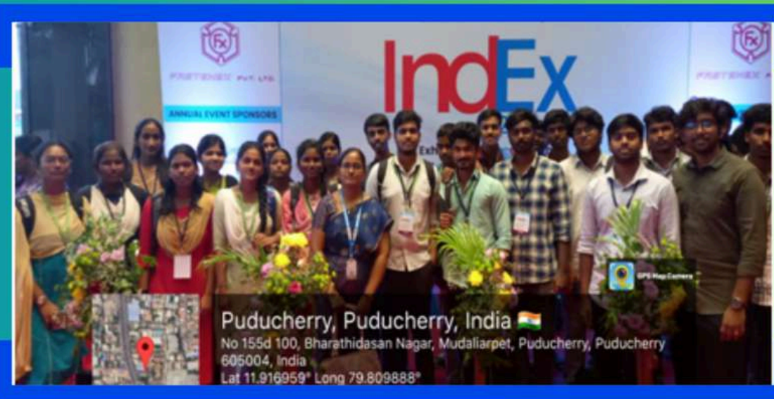
IIIrd IT A&B students visited INdEx 2025 - Industrial Exhibition at Puducherry organised by CII as a part of Industrial visit on 17.9.25