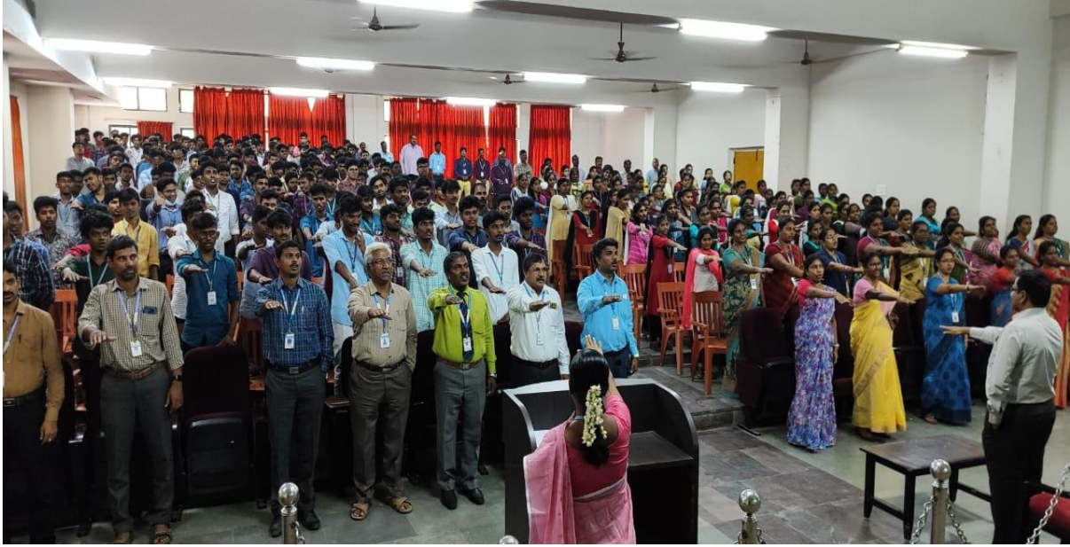
Break the Plastic Chain: Joining Hands in a Pledge for a Single-Use Plastic-Free Future – Let's Preserve, Protect, and Sustain!"