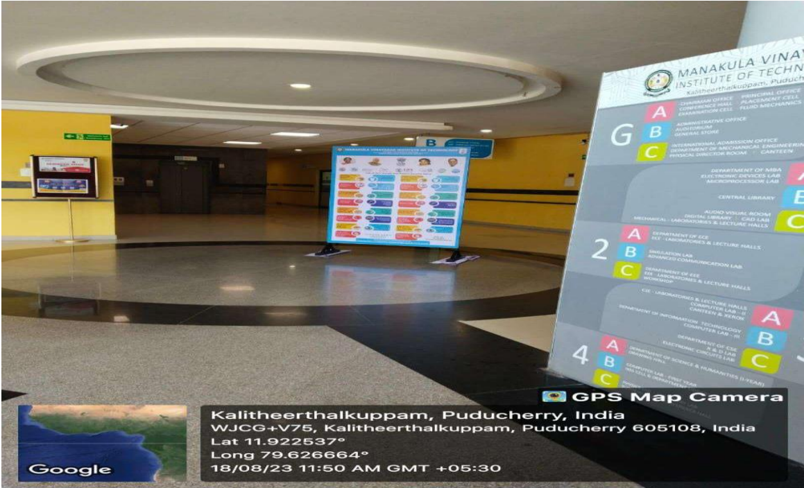
Dissemination of eco-friendly goodies, promoting a plastic-free lifestyle to promote sustainability within our campus